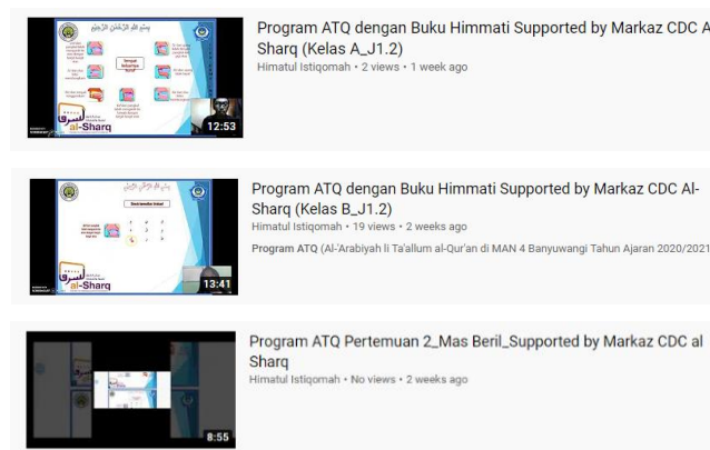
Figure 3: Documentation of Online ATQ

The time required for the program implementation were 16 meetings and it took one hour for each meeting. The documentation of the online ATQ program can be accessed on Youtube with the caption "Program ATQ dengan Buku Himmati Supported by Markaz CDC Al Sharq," as seen in the following figure.