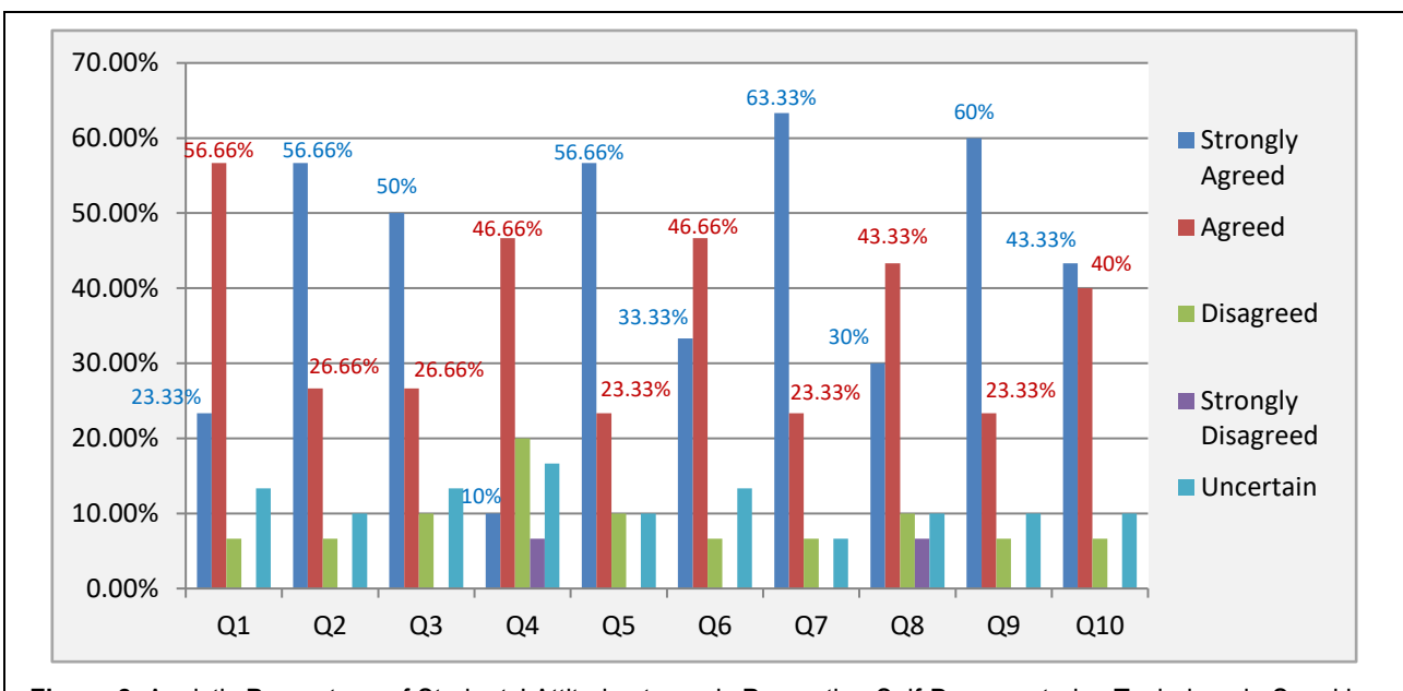
Figure 2. Analytic Percentage of Students' Attitudes towards Presenting Self-Documentaries Technique in Speaking Skill