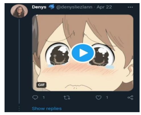
Figure 4. Example of Comments

Concerning the third research question, this part shows the reactions of internet users, as seen in Figure 3 and 4. They show that they understand the memes' context. Figure 3 employs both image and text, while figure 4 does not include text. With the expression of sadness, the users try to express their feeling through uploading images with the sad reaction. Through non-verbal language, internet users attempt to define the unfortunate sense. It proves that the memes posted by the users affect other Internet users. With memes that combine mode and media employed in the picture, the memes also have a role as speech acts. It shows how the reader of memes also sent the reaction towards the memes that indicate perlocutionary acts successfully. other memes that also suggest speech acts and combines semiotic resources are also presented as follows: