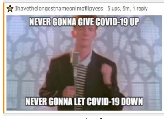
Figure 9. Example of Comment