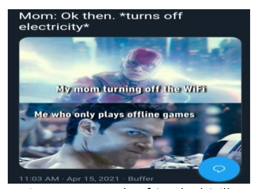
Figure 5. Example of Stacked Stills

Concerning the third research question, this part shows the reactions of internet users, as seen in Figure 3 and 4. They show that they understand the memes' context. Figure 3 employs both image and text, while figure 4 does not include text. With the expression of sadness, the users try to express their feeling through uploading images with the sad reaction. Through non-verbal language, internet users attempt to define the unfortunate sense. It proves that the memes posted by the users affect other Internet users. With memes that combine mode and media employed in the picture, the memes also have a role as speech acts. It shows how the reader of memes also sent the reaction towards the memes that indicate perlocutionary acts successfully. other memes that also suggest speech acts and combines semiotic resources are also presented as follows: