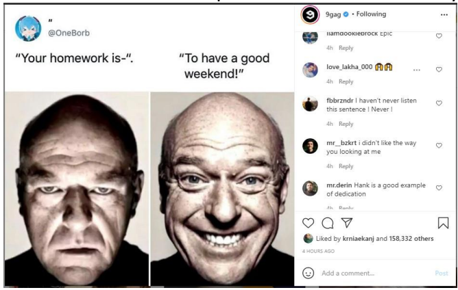
Figure 12. Example of Image Macro (https://www.instagram.com/?hl=en)

the meme with the texts since the meme is uploaded on Instagram, where the comments box is text. One of the internet users understands the background of information of the image by commenting that "hank is a good example of dedication". Knowing the context encourages internet users to give comments to the meme due to its humour. It is believed that memes aim to create humour and to perform other illocutionary acts.