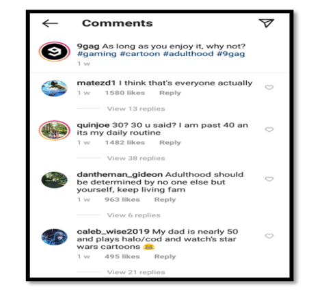
Figure 14. Example of Comments (<a href="https://www.instagram.com/?hl=en">https://www.instagram.com/?hl=en</a>)

Another example of a meme that creates humorous sense through question could be seen in Figure 15: