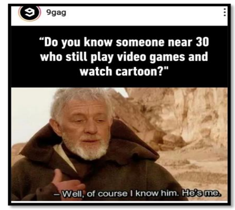
Figure 13. Example of Image Macro https://www.instagram.com/?hl=en)

Another purpose of memes, to ask a question, is presented in Figure 13 and 14. Memes address questions or questions that often insert humour cannot always be seen as serious questions. The controversy may occur when some of the creators address the questions. The questions in memes are not only about a specific topic. A standard image macro (Figure 13), Obi-Wan Kenobi is an imaginary character in the Star Wars franchise used as the central figure in the meme to ask questions. In such a case, the illocutionary acts found in this meme can include constative and directives. The meme gains several responses from internet users, as seen in Figure 13. As seen from the comments (Figure 14), the internet user understands the background knowledge of the memes. One of the internet users responds, "My dad is nearly 50 and plays halo/cod and watches starwars cartoons". It shows that she or he recognizes the character employed in the meme by mentioning Starwars cartoons. Form the comments; they all try to relate the memes to themselves. Most of them show an agreement towards the memes. Therefore, memes facilitate internet users to communicate online.