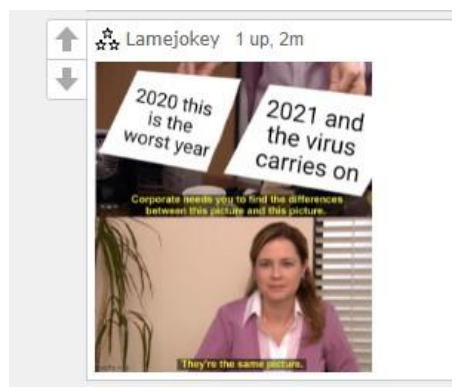
Figure 11. Example of Comment (https://imgflip.com)