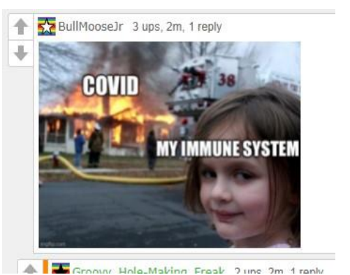
Figure 10. Example of Image Macro (https://imgflip.com)