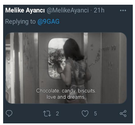
Figure 16. Example of Comment (www.twitter.com)

It shows how memes could be used to respond to the question. Before displaying the image, the meme creator asks the question. Then, the answer is in the form of a meme. This meme is a single image with its text merged in the text. The character displayed in the meme is Ryu Hwa-young, one of the South Korean actresses and singers who becomes a South Korean group named T-ara. This character represents how young ages nowadays are impressed by Korean dramas. Thus, the selection of the character is not without reason. This kind of meme has meaning potential to make a joke. A constative illocutionary act is found in this meme since it attempts to express the idea or opinions of something. Several responses toward the meme are detected, yet one example (Figure 16) shows that the readers try to answer the question addressed by the meme creator using an image macro. It is believed that internet users employ memes to communicate online.