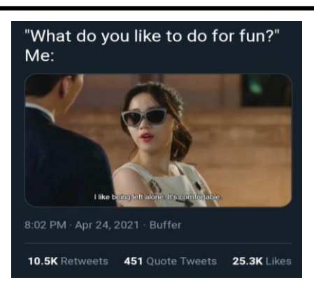
Figure 15. Example of Image Macro (www.twitter.com)