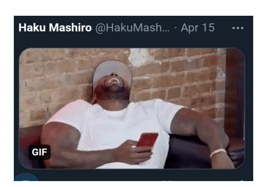
Figure 6. Example of Comment (<u>www.twitter.com</u>)

A single image macro is simply a collection of one-way memes that use images and text to comment on the world. In vital derivatives, while macros are stacked with other images, they become still stacked and read like comics (Figure 5). This comic is a basic example of the so-called vertical meme collective, a common type of still image. In this vertical, the image of an English actor named Henry Cavill, who becomes DC comics character Superman is stacked on top of a picture as in character in a flash. The flash is the name of some fighters acting in