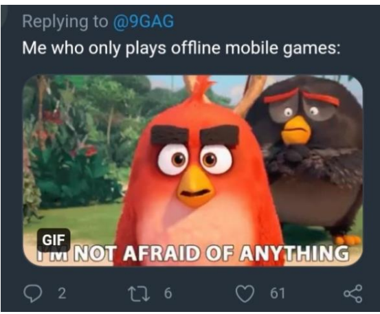
Figure 7. Example of Comment

American comic books published by DC comics. The flash shows the plain expression while Henry Cavill presents his facial expression of upset. These stacked stills offer two different pictures with different facial expressions. This meme contains the image and the texts that successfully create a humour sense toward other internet users. The texts are statements; thus, it involves in constative illocutionary acts. The meme encourages the reader to respond to the meme. The representations of their reactions are served below: