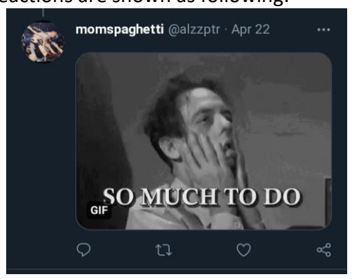
Figure 3. Example of Comments

thus, the meme involves an illocutionary directive act. Yet, the Oddity responds to Slimy, "how far you have come!" The response is such a piece of advice to Slimy and reminds the readers about what has been done. The last picture shows the steps being reached by the Slimy. Therefore, it is a kind of reflection toward the model reader. If the model readers experience that feeling, they will respond to the memes. The representations of different reactions are shown as following: