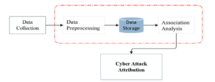
Fig. 3. The Proposed Solution for Cyberattack Attribution in CTI.

levels can only be achieved when an effective threat intelligence framework is in place. To achieve an effective threat intelligence framework, an organization needs to think of how to build a framework deemed appropriate, specifically, in gaining the hidden information behind the raw data in CTI to assist security analysts in performing cyberattack attribution. Hence, this research focused on formulating an association ruleset in CTI framework to perform cyberattack attribution in CTI. Fig. 3 illustrates Apriori algorithm technique that was used to formulate the association ruleset from CTI OSINT feeds that were collected through CTI framework.