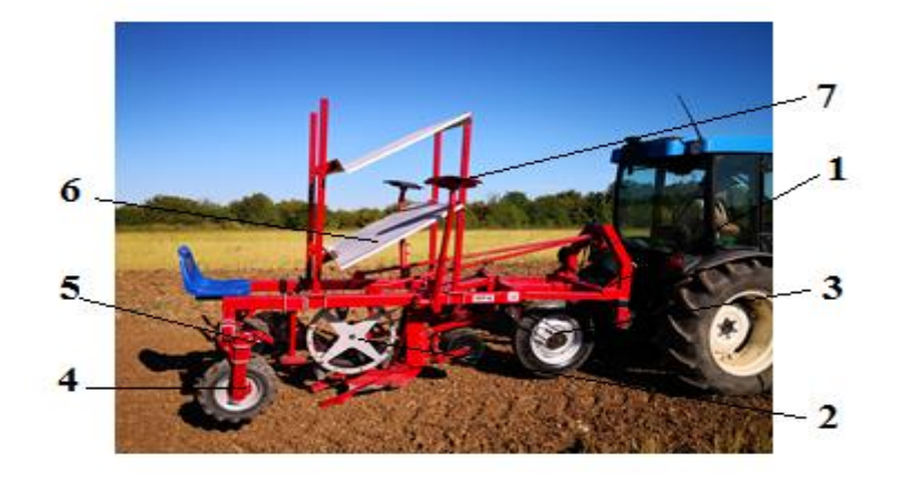
Fig.1 Machine for planting vegetable seedlings and herbs in a row, MPA symbol (**** INMA Bucharest, 2018)

To carry out the experiments, a planting machine was used in a row, equipped with a distributor with articulated cups, fig. 1, consisting of the following assemblies [5].