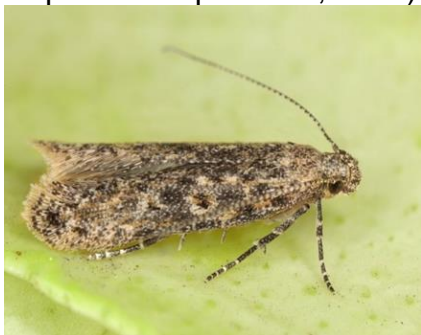
Figure 1. Tuta absoluta adult

pest. Tuta absoluta was first found in Romania in 2009. According to the National Phytosanitary Authority, Tuta absoluta was reported first in Botoșani County and then in Maramureș County (Elena Leaotă, 2009), while Băețan et al (2013) reported its first appearance in June 2009 on tomatoes imported from Spain. Tuta absoluta is an extremely dangerous polyphagous insect. It belongs to the family Gelechiidae, order Lepidoptera. The pest is a small butterfly (moth), 5-7 mm long, brown with shades of dark gray. The larva is white-green, with a black head and a brown stern (Figures 1, 2). It has 12 generations per year. An adult female can have up to 250 eggs during her lifetime. The life cycle is completed in 30-40 days, but largely dependent on environmental conditions. It has 4 larval stages, wintering as an egg, pupa or adult. Moths are more active during the night, the day being hidden among the leaves (Syngenta - Catalog of plant protection products, 2021).