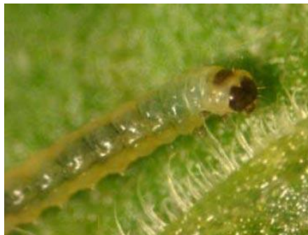
Figure 2. Tuta absoluta larva