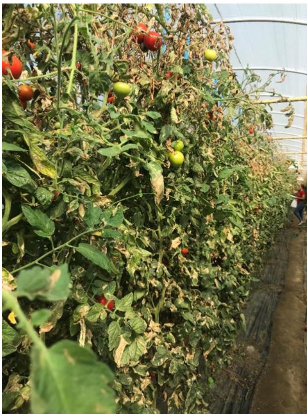
Figure 3. Tomato crop totally affected by the Tuta absoluta attack

Starting with June 24, the number of affected plants and leaves increased significantly in all the studied variants, so that after July 18 the attack will be complete, all the plants studied being affected (Table 2). It can be seen that, regardless of the product used for treatments, the intensity of the attack increases with increasing temperature and that, in the absence of other agro-phyto-technical (cultural) measures, rational crop rotation, biological control, etc., the damage caused by the attack of Tuta absoluta can be very large, reaching the point of completely compromising the culture (Figure 3).