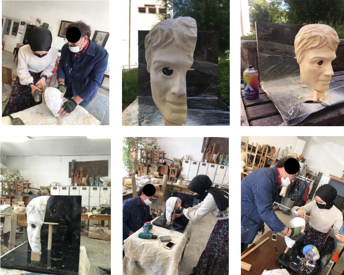
Figure 3. Creating the mask and table

The face mask designed for the front lobe of the brain, was prepared in a sculpture workshop. Firstly, the mask was modeled from clay, then placed in a plaster mold and a fiber casting was performed. The face mask was then sprayed with paint. Two square boards of 40x40 cm were attached to each other at a 90° angle to form the table. Wooden pieces to enable the 3D brain and face mask to be positioned were placed on the table. The mask and brain model were fixed on these parts with a drill. Sensors were attached to the relevant parts of the mask using a silicone gun. Holes were drilled in the 4 corners at the base of the table and the switches were added (Figure 3).