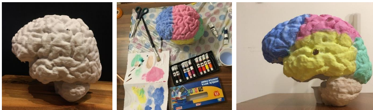
Figure 1. 3D design, painting of the brain model, drilling of the lobes

The 3D brain model, the main component of the designed model, was obtained with a nature-friendly material called PLA using a 3D Printer. Using acrylic dye, the brain lobes were painted in different colors based on the corresponding picture in the biology textbook of the Ministry of Education. A hole was drilled into each lobe of the right hemisphere of the brain using a drill (Figure 1).