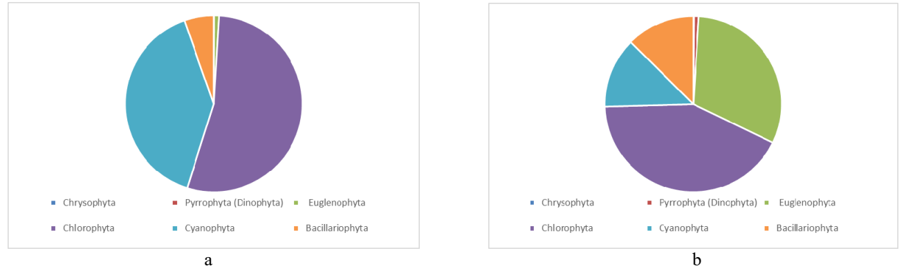
Fig. 3. Relative abundance (a) and relative biomass (b) of phytoplankton in the Kantivka fattening pond in September

become dominant. Thus, the contribution of green algae in the phytoplankton was 54 % by abundance. Blue-green algae were subdominant contributing around 41 % by abundance. However, the formation of biomass in this period was significantly influenced by euglena algae. The total abundance of phytoplankton in September was 281.16 million cells/dm<sup>3</sup>, and biomass – 64.99 mg/dm<sup>3</sup>, which indicates the highest development values of phytoplankton in this pond. In September, the dominant complex of phytoplankton species has included taxa of the genera Dictyosphaerium , Scenedesmus , Closterium , Microcystis , Trachelomonas .