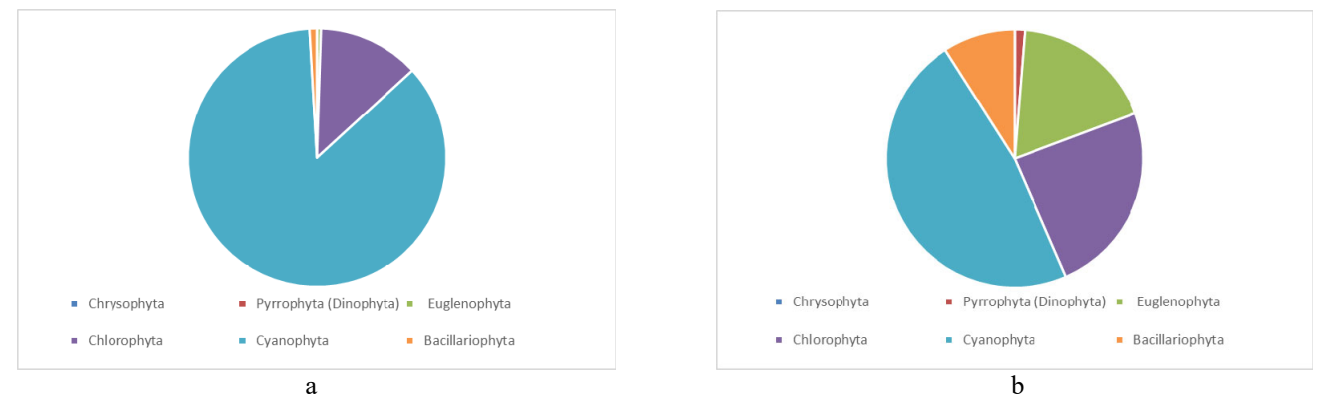
Fig. 2. Relative abundance (a) and relative biomass (b) of phytoplankton in the Kantivka fattening pond in August

The mean abundance of phytoplankton was 267 million cells/dm<sup>3</sup>, and biomass was 40.96 mg/dm<sup>3</sup> in August. The top of the pond was characterized by the highest values of algae development: 325.3 million cells/dm<sup>3</sup> and 50.16 mg/dm<sup>3</sup>. Near the dam, the abundance and biomass were slightly lower but were still at the sufficiently high level as 299.2 million cells/dm<sup>3</sup> and 40.83 mg/dm<sup>3</sup>, respectively. The development of planktonic algae in the middle of the pond was the lowest and is 176.7 million cells/dm<sup>3</sup> by abundance and 31.85 mg/dm<sup>3</sup> by biomass.