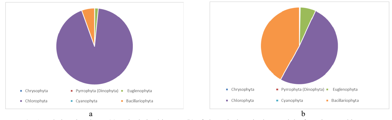
Fig. 1. Relative abundance (a) and relative biomass (b) of phytoplankton in the Kantivka fattening pond in June

pond and near dams 13 and 16, respectively. The development of phytoplankton in June shows low quantitative values. In different pond places, the abundance of algae was varied from 0.92 million cells/dm<sup>3</sup> to 4.946 million cells/dm<sup>3</sup>, and biomass was from 0.57 mg/dm<sup>3</sup> to 1.04 mg/dm<sup>3</sup>. The average for the pond was 3.141 million cells/dm<sup>3</sup>, and biomass was 0.87 mg/dm<sup>3</sup>. The phytoplankton (Fig. 1 a, b) was dominated by Chlorophyta ( Scenedesmus spp., Ankyra spp.). Their average abundance in the pond was 2.917 million cells/dm<sup>3</sup>, and biomass 0.61 mg/dm<sup>3</sup>. These phytoplankton values were insufficient to meet the nutritional needs of cultivated fishes.