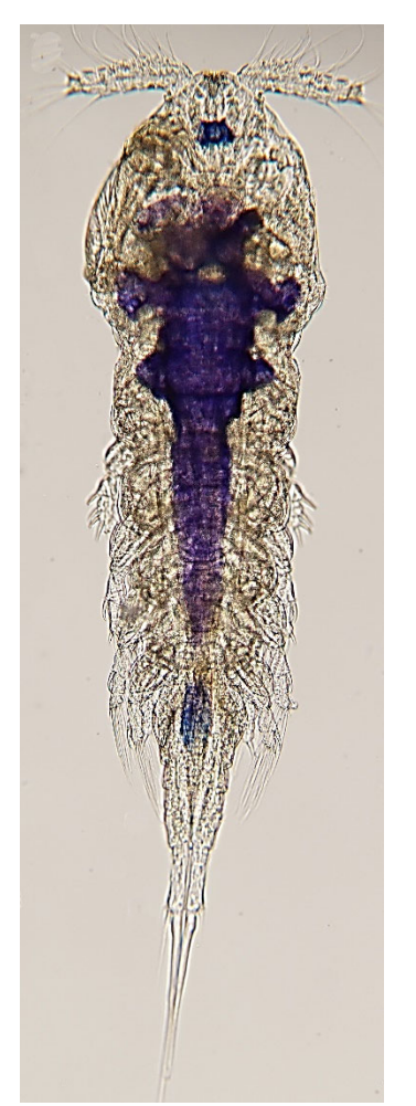
Fig. 6. Adult female of Ergasilus sieboldi

of this species in nature occurs in July-August, while it reproduces and nauplii appear in May.