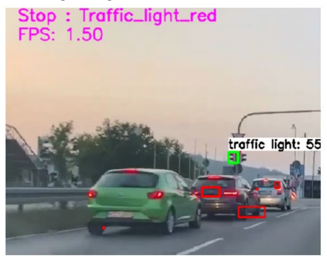
Fig. 3. The bounding boxes of back-light drawn on the video frame are out of place using Approach 1

( i ) Approach 1: The bounding box dimensions from the model output is obtained to crop the detected region of the car. Color thresholding is performed on the cropped region