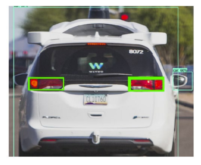
Fig. 4. Detection of Back-light with Approach 2

after converting the frame to HSV color space to detect the red regions of back light. Contour detection method is applied using OpenCV library to get the boundary region dimensions of the back-light and using the dimensions of the boundary region a bounding box rectangle around the back-light of the car is drawn. With this approach the bounding box drawn on the image frames were out of place rather than being correctly mapped onto the backlight when the video stream was run as shown in Fig. 3. Hence approach 2 as described below was taken into consideration.