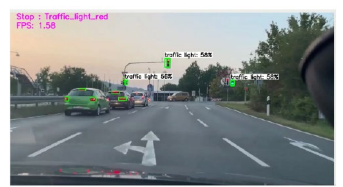
Fig. 5. Output of the proposed algorithm on raspberry pi 3B+ with the quantized model

The TensorFlow model of MobileNetSSD along with the image processing algorithm is evaluated both on Raspberry Pi 3B+ and on a laptop with Intel i7 processor. The comparison is drawn and the performance is evaluated with FPS, inference time and accuracy of the model as shown in Fig. 6. As the deep learning model requires good computing resources which is limited and constrained in Raspberry Pi 3B+ we observe a high inference time and low FPS. Hence a