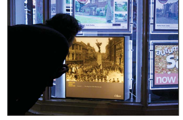
Fig. 8 Lightbox, Stories Seen through a Glass Plate. Lewes, 2014. (©Reeves Archive Project).

history, the project stimulated a sense of ownership of the past on the terms of the street space. The exhibitions created an immersive and intense space which could be reauthored and subjective time projected into the space of the street (McQuire, 2012, p. 137). It represents a relational, situated and richly textured temporal environment, bound up with micro and macro social experience, as the street turned into an immersive lived landscape of the past (Keightley, 2012, pp. 2, 4).