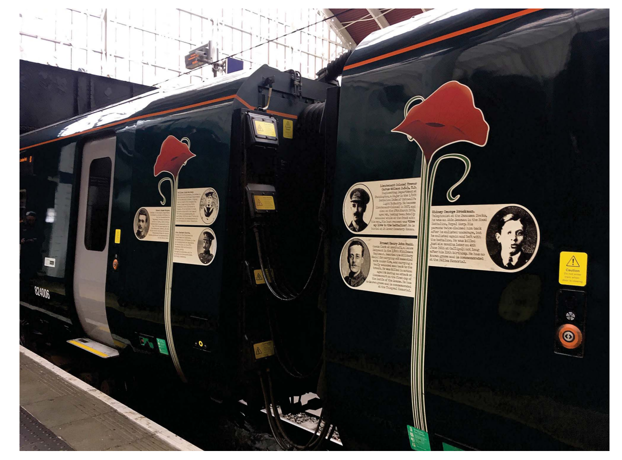
Fig. 4 The 'fallen' of the Great Western Railway. Paddington Station, London. 2019.

One should also recognise that the dual immersive qualities of 'just there' and 'demanding attention', that 'placing' that I noted at the beginning, have been quickly marketised. For instance, 'just there' as corporate performances are used to legitimate