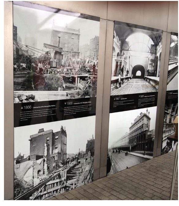
Fig. 5 Paddington Station, London. 2016.

landscape of tens of thousands of people, is a display (Figure 5) on the building of the underground and the Paddington cuts, the ghostly figure of the engineer Isambard Brunel presiding over the photographic timeline. These are rich photographs, full of workers, their presence held in the photographic trace. The whole space of the engineering project is linked as historically contiguous, as the photographs populate the space with its original workforce, while round on the other side of the station, modern engineering is self-consciously