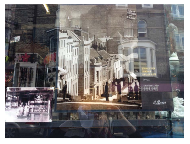
Fig. 9 Temporal layers. Lightboxes and windows and streets, 2014. (author's photograph).

Thus, the light-boxes became shrine-like objects as viewers stood quietly in the street in a state of contemplation. I am told that people came from far and wide – mini-bus loads of ancient Lewes-born relatives were brought to see the photographs. It became a collective family album played out in the space of the street. But it also operated on a pre-cognitive level, creating a low hum in Tina Campt's sense, as it was absorbed into the background of daily life by neighbourhood