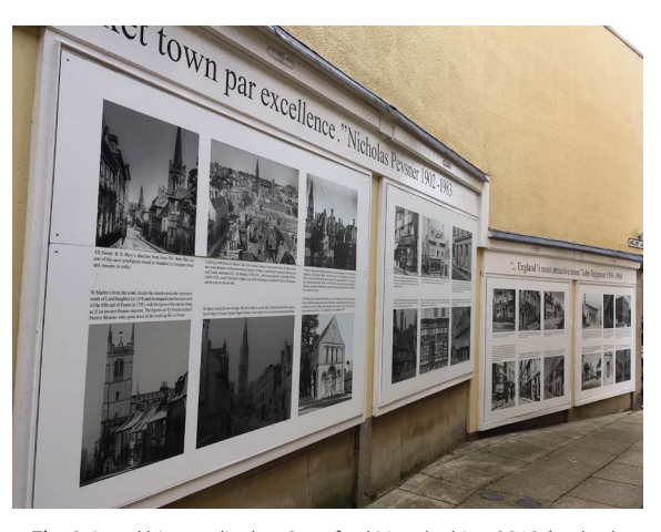
Fig. 2 Local history display. Stamford Lincolnshire. 2019 (author's photograph).

Historical photographs in the public space are ever more present, given the ease with which photographs can now be reproduced, resized and remediated through high-resolution scans to create immersive environments. While digitally enabled however, the photographs that concern me here are not defined by their fluid digitality, but through their reality affects in creating a tangible legacy of "the real" as an intensifying modality. Once alerted to their presence, one finds a plethora