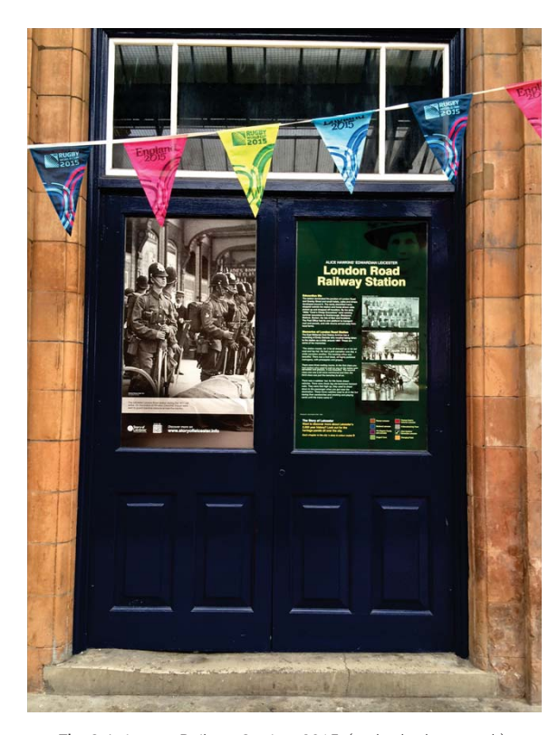
Fig. 3 Leicester Railway Station. 2015. (author's photograph).

and immediacy of the past, as visual traces of the past are floated into the present. Their immersive potential takes many forms, from artists' interventions to modest interactions with and uses of photographs to historicise the everyday spaces of contemporary experience such as shops, stations and