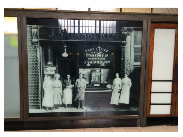
Fig. 6 Historical photograph, Sainsbury's supermarket, Leeds Railway Station. 2016 (author's photograph)

landscape of tens of thousands of people, is a display (Figure 5) on the building of the underground and the Paddington cuts, the ghostly figure of the engineer Isambard Brunel presiding over the photographic timeline. These are rich photographs, full of workers, their presence held in the photographic trace. The whole space of the engineering project is linked as historically contiguous, as the photographs populate the space with its original workforce, while round on the other side of the station, modern engineering is self-consciously