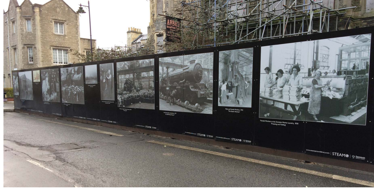
Fig. 7 Swindon, builder's hoardings. 2017

With a different flavour, the local government is doing something similar in Swindon, an unremarkable ex-railway town,