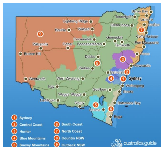
Figure 3. The map of NSW, Australia

Source: Australia Guide, New South Wales, 2021 29