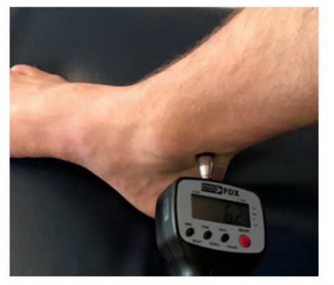
Testing at the Tibial Nerve location (Butler, 2000)