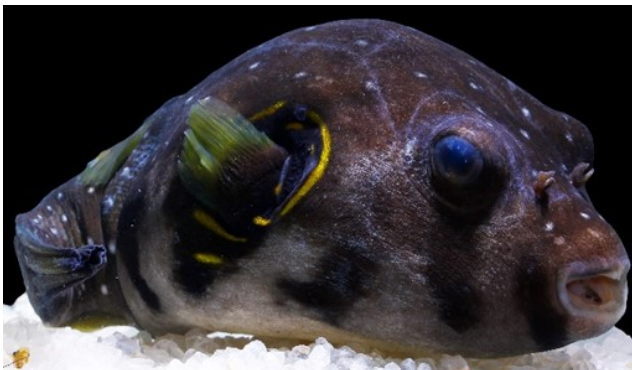
FIGURE 2 Live photograph (ex-situ) of Arothron hispidus from Frasergunj fishing harbour, West Bengal, eastern India: ZSI F 13589/2.

Arothron spp. are known for their polychromatic colouration at the intraspecies level and different life stages, making it difficult to identify them through pictures (Su and Tyler 2017; Bariche et al. 2018). There also exists high variability among populations from different regions. Randall et al. (2012) examined the variability of A. hispidus between the Red Sea, Indian Ocean and Pacific Ocean populations. They commented that sexual dichromatism could play a role in such variations. The individuals collected from West Bengal seems to be sub-adults, for they have fewer white spots on their body, and also, the circles around the eyes are incomplete (Figure 2).