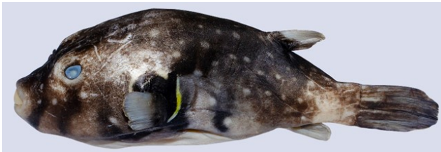
FIGURE 1 Photograph of preserved Arothron hispidus from Frasersgunj fishing harbour, West Bengal, eastern India: ZSI F 13589/2, 112.8 mm SL.

Material examined. ZSI F 13589/2, 2 ex, 111.7–112.8 mm standard length (SL), Frasersgunj fishing harbour (West Bengal Coast), 16/05/2019, Priyankar Chakraborty.