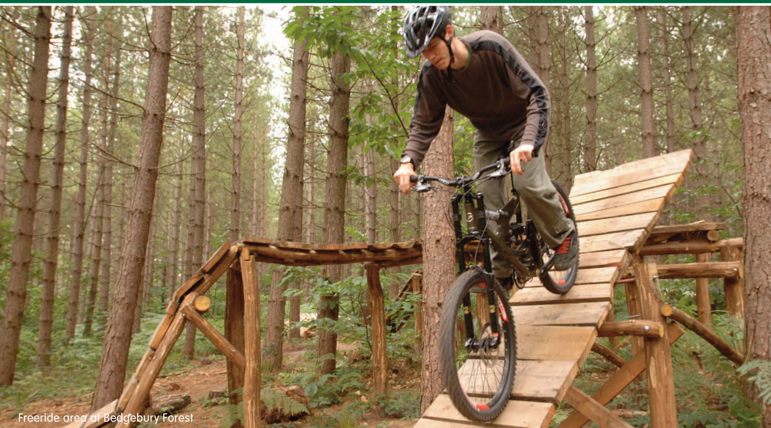
Freeride area at Bedgebury Forest