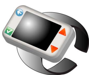
Figure 1. PPT1 Concept A

Participants (across all participating EU countries) seem to prefer wearing a device on the wrist. This finding is supported by both survey data with over 100 participants across five EU countries (over 55% of participants preferring to wear the device on the wrist) and focus group data from the UK. This therefore led to the recommendation that the device to be developed within ENABLE should be a wrist worn device as this seems most acceptable to end users across selected EU member states, to both men and women and all age ranges. Although some concern was expressed by the participants with regard to wearing the device at all times (such as discomfort and for practical reasons), respondents also saw this as a benefit as it would eliminate the risk of forgetting to take the device with them which could be problematic in case of an emergency.