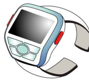
Figure 3. PPT1 Concept C