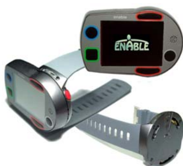
Figure 7. ENABLE Interface/Strap System