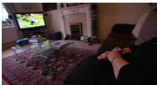
Figure 11 and 12. Vi, a UK participant using the system outside of and within the home