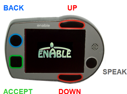
Figure 8. ENABLE Command Buttons