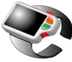
Figure 2. PPT1 Concept B