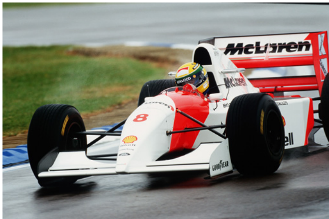
Figure 4 Substitution of Marlboro with McLaren on a McLaren F1 car in 1993.

occasionally even during the season. Furthermore, if it was a case of advertising branding, Philip Morris would have to own a legal copyright on it'. 59 An article on a motorsport website ( http://www.autosport.com/ ) quoted from a Scuderia Ferrari Marlboro press release, which said that criticism was 'based on two suppositions: that part of the graphics featured on the Formula 1 cars are reminiscent of the Marlboro logo and even that the red colour which is a traditional feature of our cars is a form of tobacco publicity...neither of these arguments have any scientific basis, as they rely on some alleged studies which have never been published in academic journals. But more importantly, they do not correspond to the truth'. 60