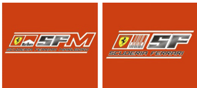
Figure 2 Ferrari F1 team names and logos, 2007 and 2010.

livery. This was to promote Philip Morris' new Marlboro Lights brand of cigarettes. The colour did not work on television and the experiment was never repeated. 33