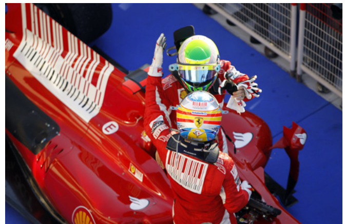
Figure 7 Marlboro 'barcodes' on both the Ferrari race car and the driver's clothing in early 2010 (LAT Photographic).

techniques known as 'trademark diversification' and 'alibi marketing'. 61 Trademark diversification involves the use of a cigarette brand name on the branding of other and typically unrelated products, such as clothing. 62 Alibi marketing involves distilling a brand identity into its key components, such as the distinctive red and white colouring associated with the Marlboro brand, or the shade of purple used by Silk Cut, and using these to promote the brand in place of a conventional logo or trademark. 63 This study was carried out to assess the validity of Ferrari's assertion that barcode design displayed on their F1