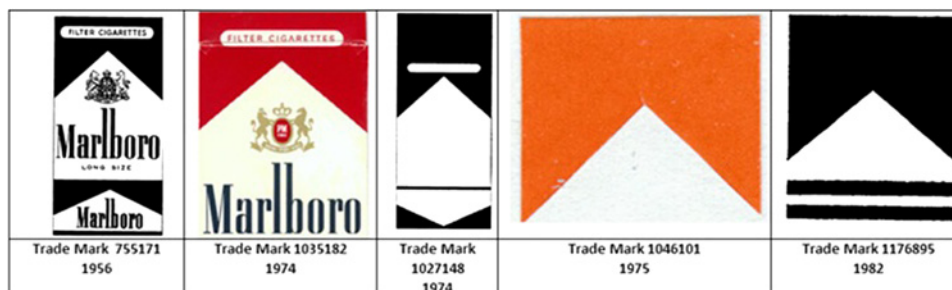
Figure 3 A selection of Philip Morris trademarks registered in the UK 1956–82.

When challenged by a series of media reports in early 2010 that the barcode design was in reality a Marlboro logo, Ferrari responded that 'the so called barcode is an integral part of the livery of the car and of all images coordinated by the Scuderia, as can be seen from the fact it is modified every year, and,