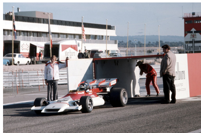
Figure 1 Marlboro branded BRM F1 car emerging from a mock-up of a giant Marlboro cigarette pack in 1972.

The Ferrari F1 team traditionally races in Italy's historic national motor racing colour, red. Philip Morris documents reveal that the company has long recognised the importance of association with Ferrari, and the red colour schemes shared by Ferrari and the Marlboro brand. Only once in F1 has Marlboro made use of a colour other than red, at the 1986 Portuguese F1 Grand Prix, when McLaren ran one car in a gold and white