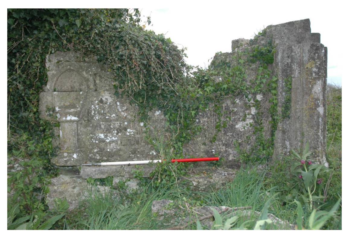
Figure 6 The interior east wall of the south porch showing the relative locations of the stoup (left) and the stone bench. The dip in wall above indicates the former position of the quatrefoil window.

The porch also contains stone bench-seating. On the east wall this feature remains almost complete but there are traces of it on the west side too. This seating would have been for the use of the Church Wardens and other parochial worthies. Figure 6 shows this feature adjacent to the stoup (left). Above and centre, the remaining wall dips downwards. This was the position of a quatrefoil window that has vanished since it was recorded by the Royal Commission (1970, 274-5). The creeping incursion ivy is self-evident.