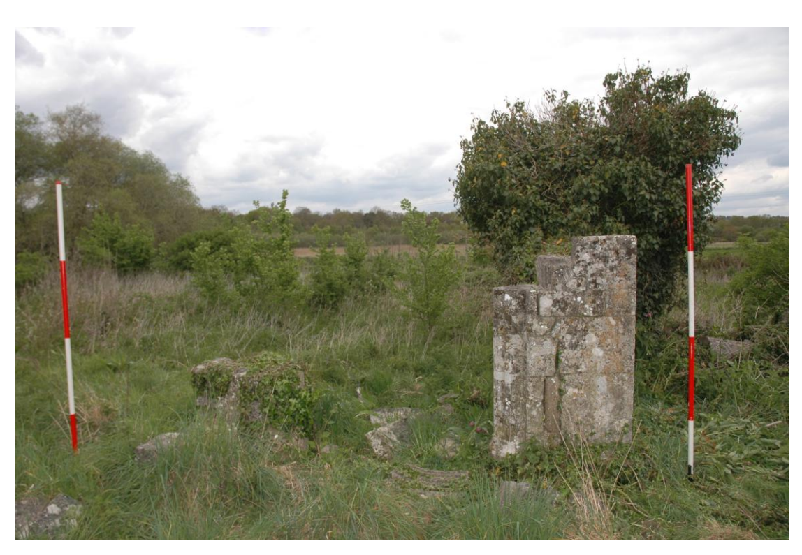
Figure 7 The in situ stones of the south porch arch. Former component stones lie scattered as they fell.

Only the lowest levels of the south porch arch survive in position (Figure 4 and 7). Other component stones lie scattered around the site of the arch with no indication that any are missing.