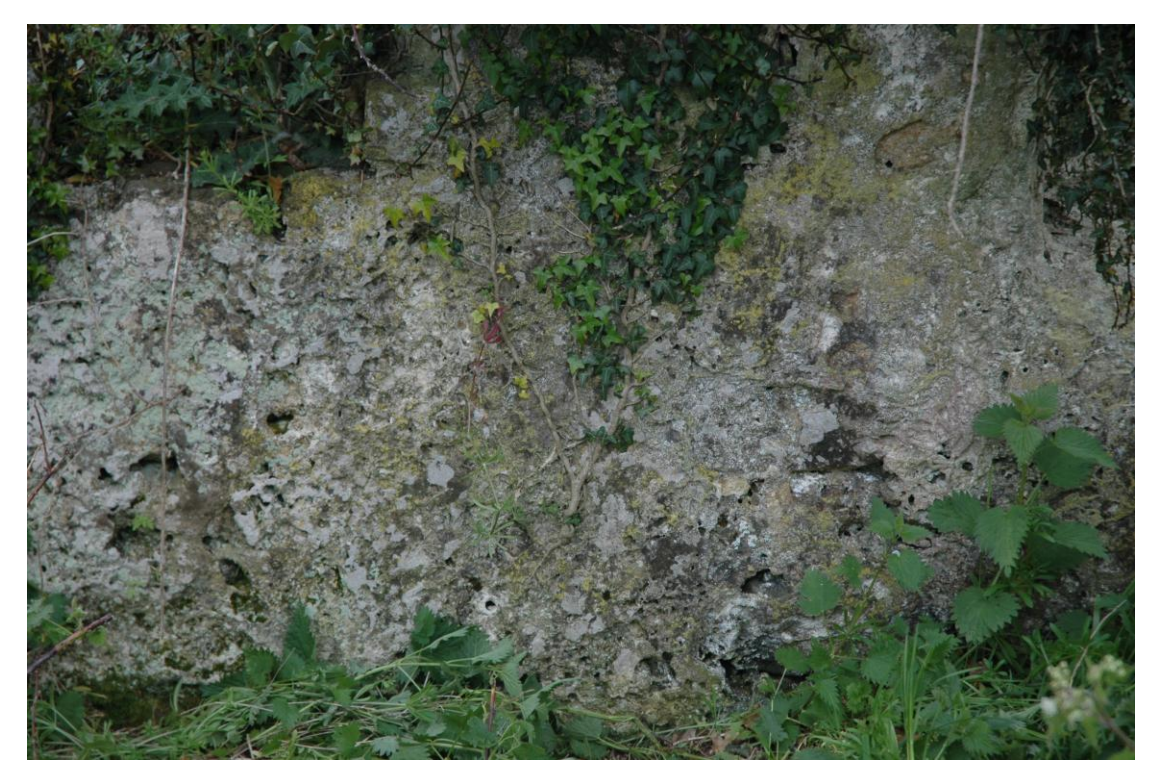
Figure 3 The interior of the south wall showing the surviving traces of the lime plaster that conceal the rubble wall.