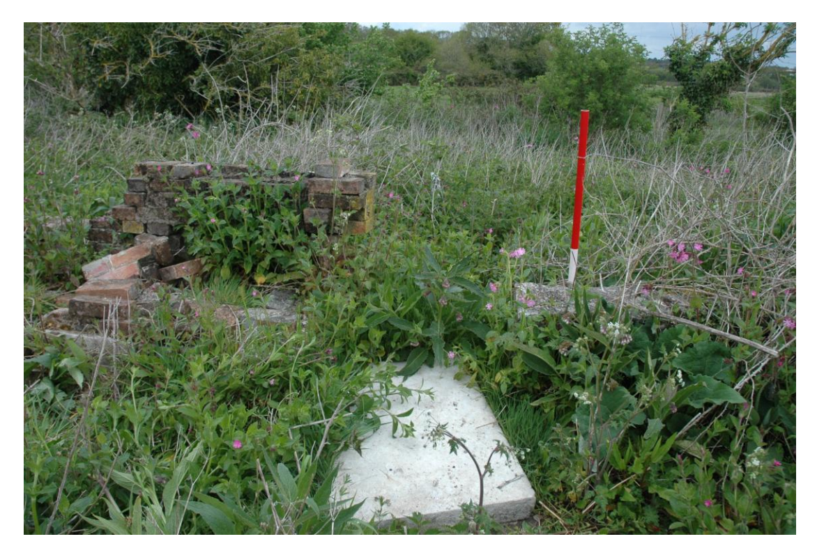
Figure 9 The remains of two chest tombs to the north of the church. To the left is the brick-built example, to the right, limestone blocks. In both cases the dedicatory upper slabs have been displaced.