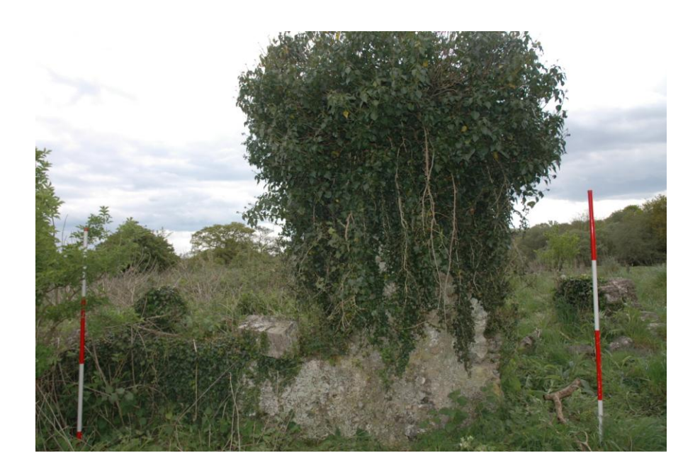
Figure 8 The internal elevation of the surviving south wall showing ivy ( Hedera helix ) firmly rooted into the top of the rubble fabric.

To the left of Figure 8 ivy cover can be seen to have spread to the much lower surviving window sill of the south wall. Here the situation if different for the ivy is ground rooted and removal might be considered. If this option is preferred, then a sacrificial cap of locally cut turf is recommended.