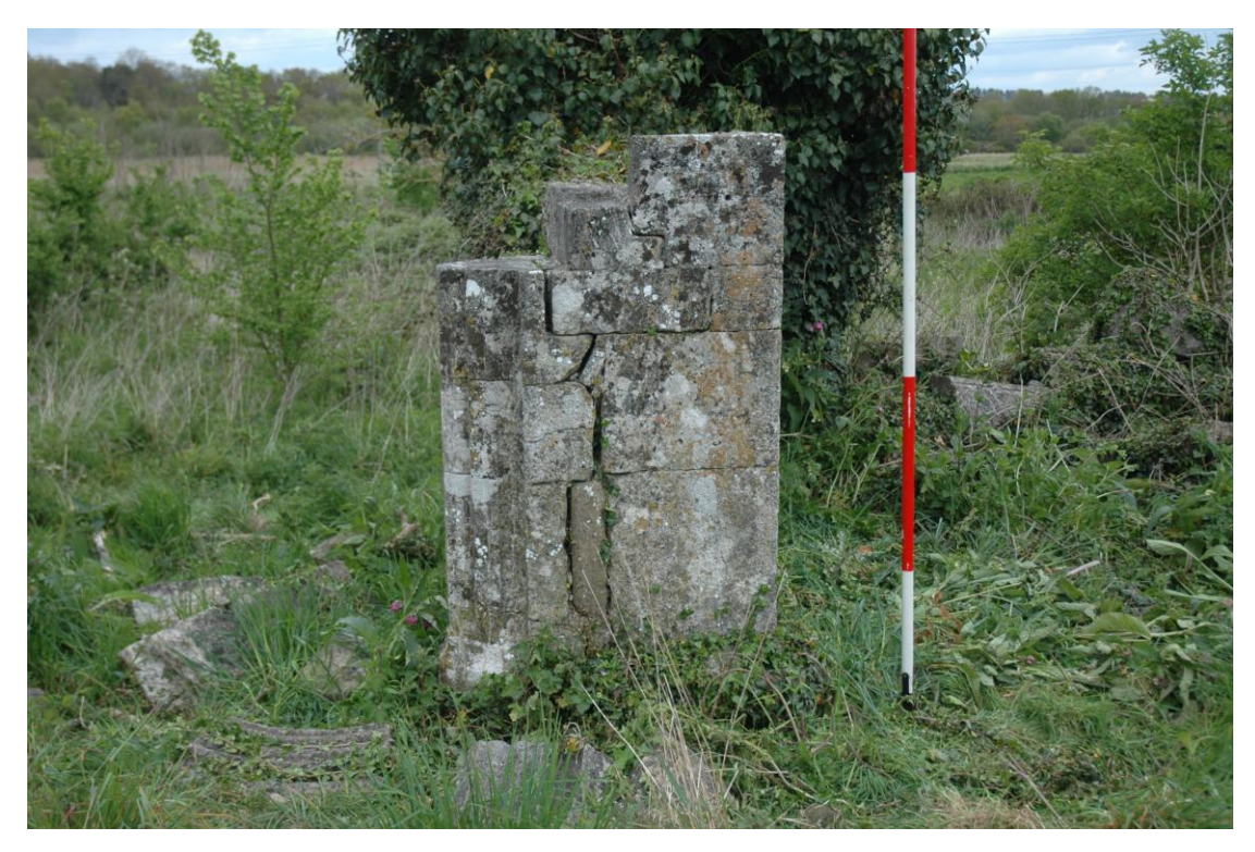
Figure 2 The south-east corner of the porch showing the anomalous slab stone close to the ground and the dog-leg cutting of the three stones immediately above.