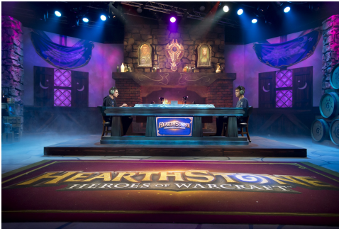
Figure 1: Snapshot of a game in the 2016 Hearthstone world championship [20]. Players are seated facing each other, allowing eye contact.

is a non-invasive affective input channel, as it can be achieved with inexpensive commercial hardware and open-source software such as OpenFace [2]. Facial expression analysis and video games have been combined in multiple studies discussing various topics, such as affective gaming [22, 27], game personalisation [7], player affect evaluation [24, 28] and alternative gameplay mechanisms [25]. Recently, Doyran et al. [9] published a rich dataset that enables multi-modal, multi-player affect and interaction analysis through capturing the facial expressions of board game players.