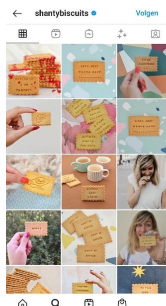
Figure 1: Overview of the Shanty Biscuits Instagram feed (@shantybiscuits), which is used for our case study.

Earlier studies on social presence in computer-mediated-communication fall into two categories: controlled experiments and large-scale corpus studies. Cyr et al. (2009) provide an example of a controlled experiment. They distinguish three levels of social presence (low, medium, and high), and present users with carefully manipulated stimuli, to see if social presence affects user trust in e-commerce websites. An important contribution of their study is that while high levels of social presence (display of human faces) were the most appreciated, participants found medium levels of social presence (display of parts of the human body other than the face) confusing, but still better than the complete absence of a person. The downside of this study is that it is unclear to