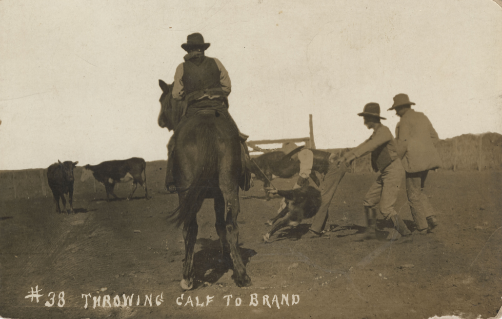
#38 THROWING CALF TO BRAND