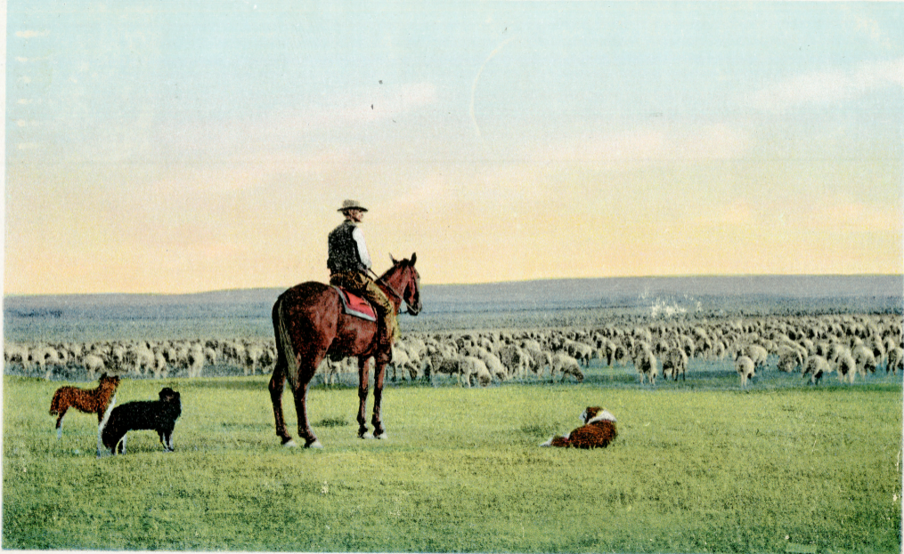
7788 SHEEP HERDING IN THE WEST