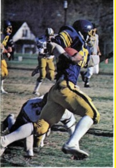
MOREHEAD STATE UNIVERSITY