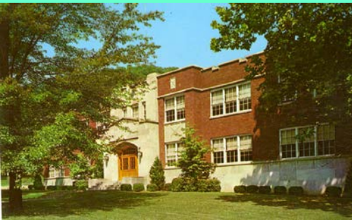
Left: The first part of Baird Music Hall was constructed in 1954.