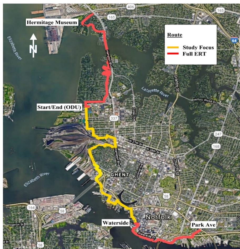
Figure 1. Map of the Elizabeth River Trail with data collection section. Note: Original graphic created using Google Maps.