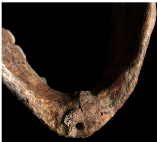
Figure 5. On the inferior part of the lower jaw there is a thickening of the bone with one larger and two smaller openings (author Vyroubal V.).