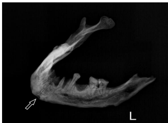
Figure 6. X-Ray scan of the mandible. Visible canal (white arrow) on anterior part of the mandible in the incisor region.