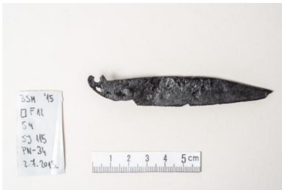
Figure 9. Razor blade found at the site Bijela - St Margaret (author Škudar J.).