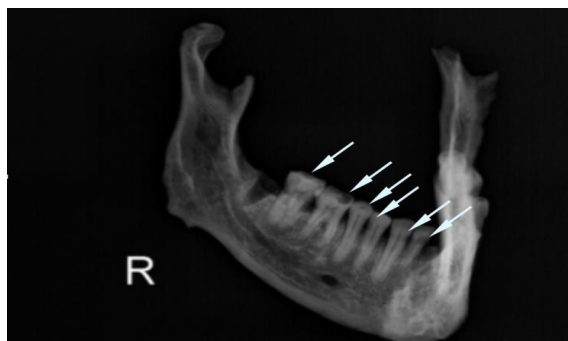
Figure 8. X-Ray scan. Visible demineralized changes on the teeth.