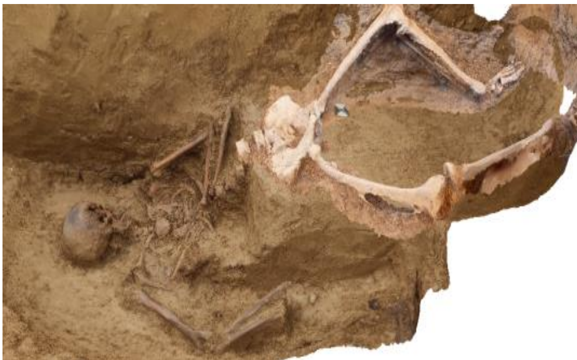
Figure 1. Atypical position of the individual from the grave 22 (author Gligora V.).

while the upper part of the skeleton (head and torso) was located deeper than the lower part of the body (pelvis and legs). The legs were spread at the knees, and the feet were resting on the walls of the burial. Since labile articulations were preserved, and in anatomical position it can be assumed that this was a primary burial, i.e. that burial occurred rapidly after death (13). No burial goods were found in the grave.