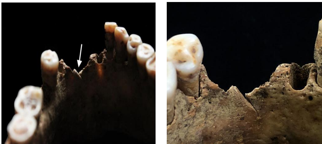
Figure 4 Left: 7 mm long antemortal incision on the mandible. Right: A detail of the antemortal incision