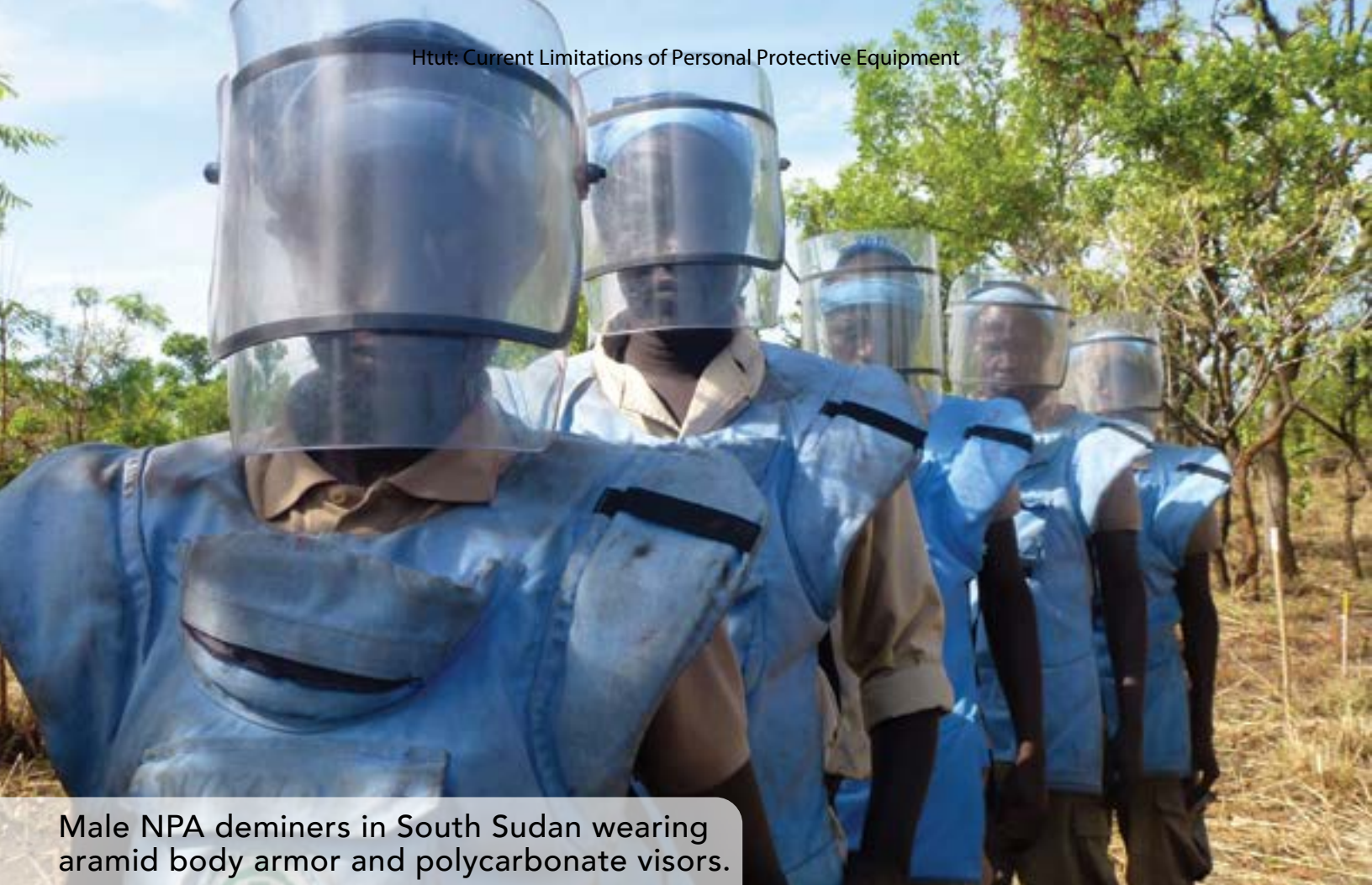
Male NPA deminers in South Sudan wearing aramid body armor and polycarbonate visors.

capital-intensive nature. As a plastic polymer, polycarbonate does not naturally bio-degrade in landfills and particulate shedding can occur which can further add to microplastic pollution. For example, Zhang et al., 39 estimate that 310 t of microplastic polycarbonate enter water systems annually in the form of sewage sludge in the United States. Polycarbonate waste has been documented to leach a precursor additive compound bisphenol A (BPA) into water sources. Although longitudinal public health implications have yet to be studied, evidence presented by Konieczna et al., 40 suggests a strong relationship between prolonged BPA exposure and endocrine disorders in humans. According to Morin et al., 41 “BPA is commonly found in landfill leachate at levels exceeding acute toxicity benchmarks” and in Norway it was reported that concentrations of 188 mg +125 mg of BPA leachate was present in every 1 kg of solid plastic waste. 42 To the author’s knowledge, there have not yet been any definitive studies on the proportion of polycarbonate in overall global plastic waste and the extent to which this has caused environmental damage in developing countries (particularly mine and explosive remnants of war [ERW]-affected countries) is unreported.