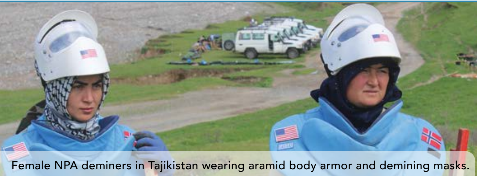
Female NPA deminers in Tajikistan wearing aramid body armor and demining masks.