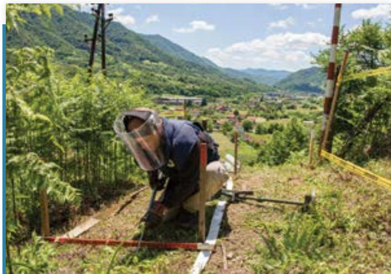
Male NPA deminer in Bosnia and Herzegovina conducting clearance while wearing aramid body armor and a polycarbonate visor.

Norway to investigate the criteria for and facilitate the development of the “Next generation of Personal Protective Equipment (PPE) in Mine Action and Disarmament.” To that end, this paper expounds upon Smith's analysis, further identifying and considering some of the major limitations in the current generation of PPE typically used in the mine action sector. This paper explores the technical limitations of the materials used as well the operational constraints and in doing so, develops a framework through which next generation PPE suited to mine action operations can be developed.