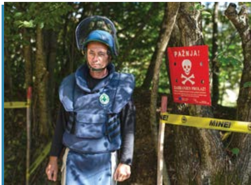
Male NPA deminer in Bosnia and Herzegovina wearing aramid body armor and a ballistic helmet with a polycarbonate visor.

While the information provided from these accidents does not take into account the method of injury and circumstances that could be aggravating or mitigating factors (i.e., victim position,