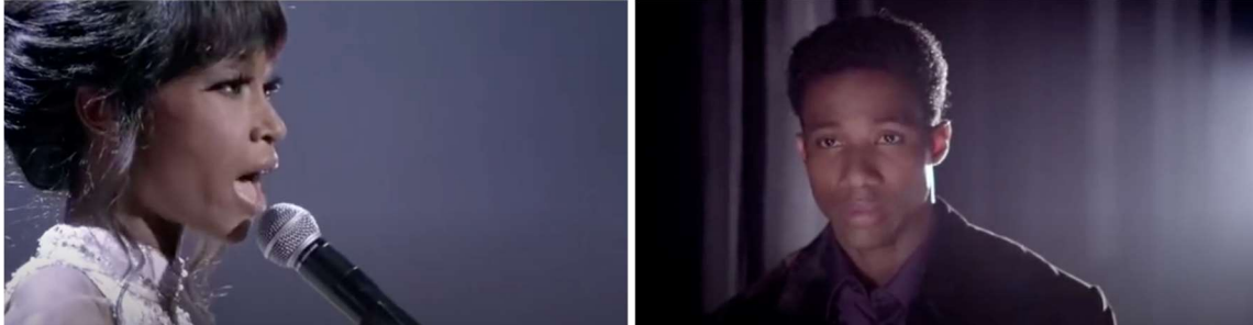
Figures 9 and 10

on stage in front of a large audience at an unidentified concert hall (figure 9), singing her signature song from the soundtrack of The Bodyguard . Like Louis in Lady Sings the Blues , Bobby stands in the wings of the stage; Whitney’s performance is intercut by thirteen close-ups of Bobby watching his wife sing (figure 10).