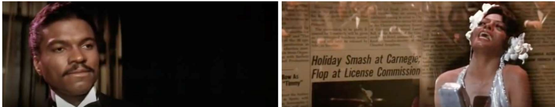
Figures 1 and 2

and long shots, alternated with three close-ups of ‘her man’ Louis standing in the wings watching Billie perform (figure 1). While she is singing, newspaper headlines are superimposed on the screen, informing the non-diegetic, off-screen audience that, although the performance is/was a ‘smash’, Billie did not receive a new license (figure 2).