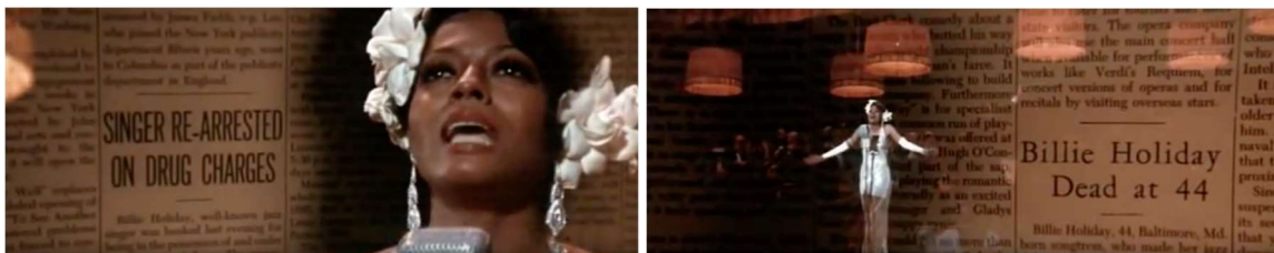
Figures 3 and 4

The triumph of the performance (which continues until the end of the film) is thus contrasted with the tragedy of the narrative, supplied by the newspaper headlines reporting Billie’s relapse into drugs, presumably caused by the rejection of her license application (figure 3), and eventually her death (figure 4), presumably caused by her drug addiction.