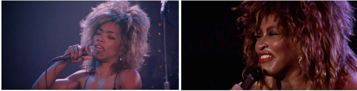
Figures 7 and 8