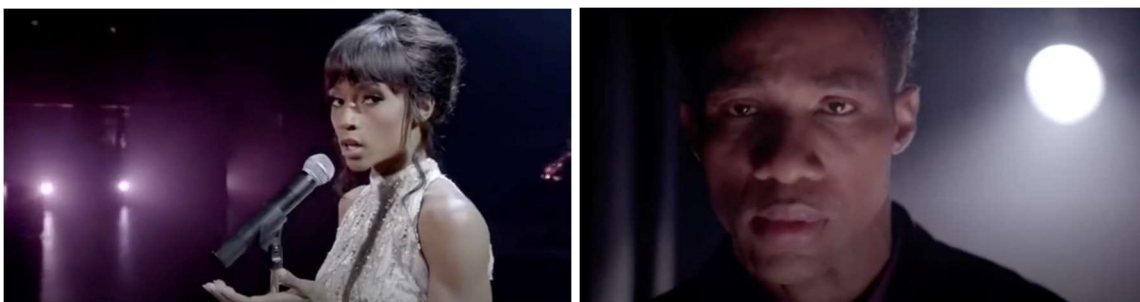
Figures 11 and 12

The performance of the song has a threefold function. First, similar to the biopic’s other musical numbers, it is a showcase of Whitney’s talent and as such provides the film with a triumphant finale. Second, with this song, Whitney is saying ‘goodbye’ to her audience, at least the off-screen one, as this is her ‘final’ performance in the film (in ‘real’ life, Whitney Houston went on a controversial ‘comeback’ world tour in 2009-2010, which, due to her erratic vocal performance, and in particular her failure to reach the high note of her signature song ‘I Will Always Love You’, was widely perceived as a showcase of her tragic downfall). 29 Third, and most important for the biopic’s narrative, the song signals the ‘bittersweet’ romantic ending of her relationship with Bobby. 30 When Whitney sings the line ‘I hope life treats you kind and I hope you have all you’ve dreamed of’, she looks directly at Bobby (figure 11), who answers her gaze, creating an eyeline match (figure 12).