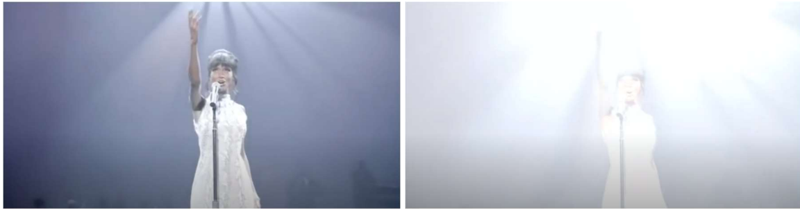
Figures 13 and 14

light, signifying — quite obviously — her death (figure 14). Here the triumph/tragedy divide is reconciled. Not only is her relationship with Bobby brought to a close (he clearly loves her, yet, as Whitney sings, 'we both know I'm not what you need'), but the tragedy in her private life is also left behind, including the tragedy that was still to come, undoubtedly known to the off-screen audience, yet left untold.