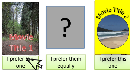
Figure 1: An example of a relative question in a questionnaire aimed at eliciting preferences.

Question: Which movie do you prefer to watch?