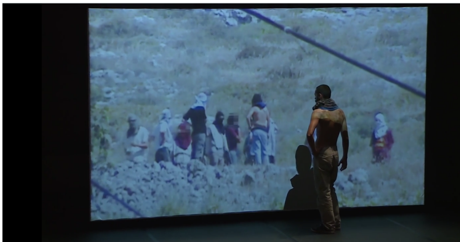
Figure 5. Image partly projected on Zaides. [photographer unknown, group of face-covered settlers with slings to throw stones, 2009]. Screen capture from general rehearsal documentation (13:09), Festival D'Avignon , July 2014.