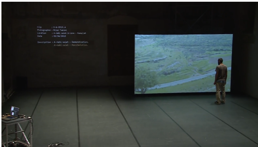
Figure 1. Zaidés positioned explicitly as a viewer [Bilal Tamimi, A-nabi saleh – Demonstration, A-nabi saleh, 2010]. Screen capture from general rehearsal documentation (05:40), Festival D’Avignon , July 2014.