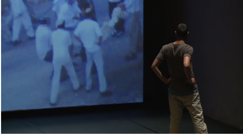
Figure 2. Shadowing depicted figures for the first time [Awani D'awa, settlers fighting against the border police, Hebron, 2007]. Screen capture from general rehearsal documentation (8:02), Festival D'Avignon , July 2014.