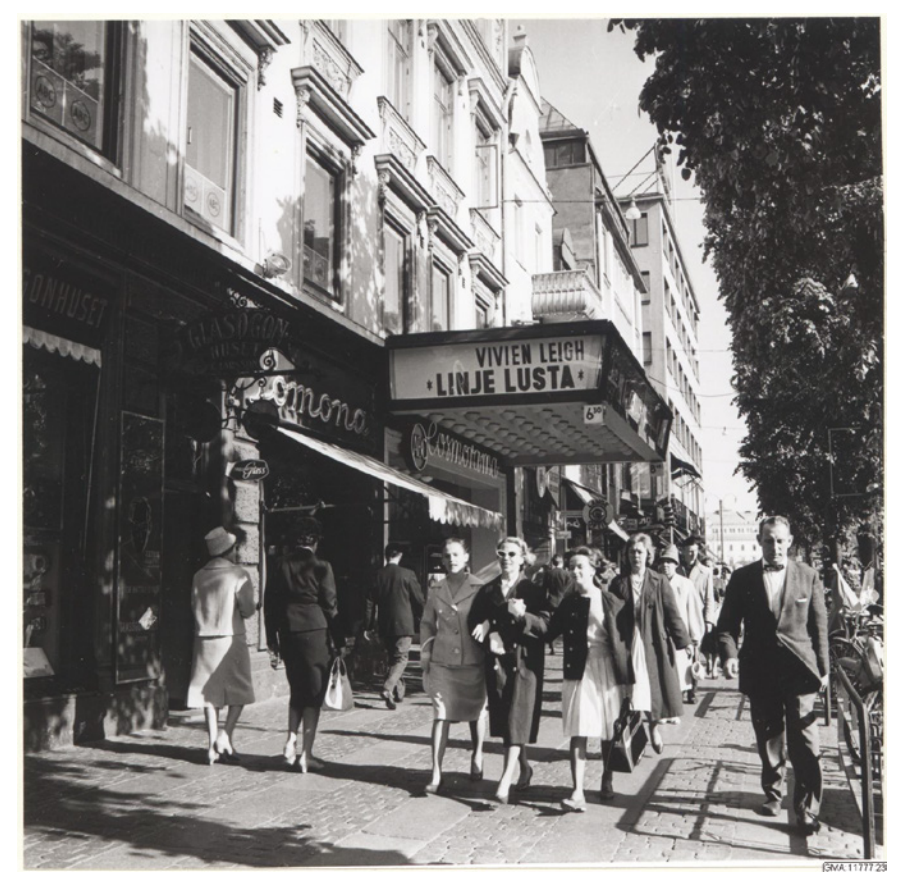
FIGURE 1 The Cosmorama cinema in Gothenburg from 1952

parts of it have been explored by researchers as well as analysed comparatively for paper presentations at conferences (Pafort-Overduin, 2017; Pafort-Overduin et al., 2017; Pafort-Overduin et al., in press).