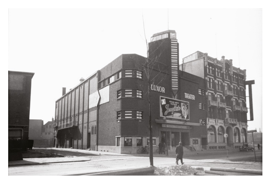
FIGURE 2 View of the Kruiskade and corner of the Nieuwe Kerkstraat in Rotterdam, showing the Luxor cinema, that had survived the 1940 bombardment of Rotterdam PHOTO BY GERARD ROOS, 1946, CITY ARCHIVE ROTTERDAM.

The 162 cinemas included in the data set are situated within the city boundaries as defined through two interrelated aspects: as a central place performing comprehensive services for its surrounding area and with public transportation that links its spaces of production, settlement and services (Harris & Ullman, 2005).