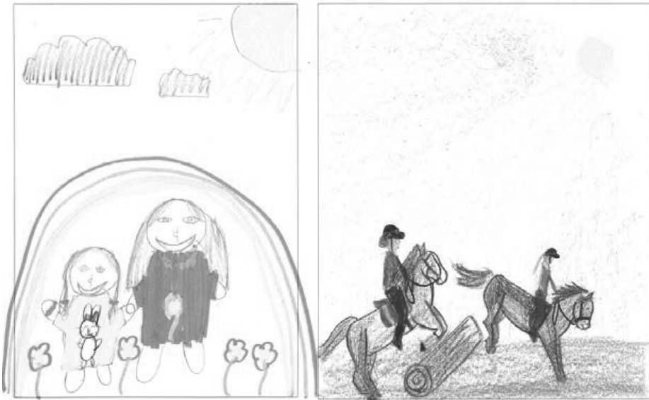
Figure 1. Examples of drawings reflecting high levels of closeness. Both drawings are colorful and detailed (e.g., rabbit on the student’s shirt in drawing 1) and engaging to look at (vitality/creativity). The figures look happy and connected, as shown by moving figures (e.g., teacher and child riding horse together in drawing 2) and happy facial expressions (pride/happiness). Both drawings are made by girls (grade 4 and grade 5, respectively). Color version available as an online enhancement.

as scrunched or constricted figures and angry facial expressions (tension/anger), differentiation of size of figures and distorted or exaggerated body parts (role reversal), and fantasy themes or unusual or morbid symbols (e.g., sharp teeth, cannons, dragons, swear words; bizarreness/dissociation). See Figure 2 for examples of drawings reflecting high levels of conflict.