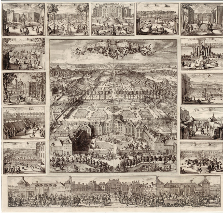
FIGURE 3 View of Het Loo , engraving by Romeyn de Hooghe, 1690-1694 and/or 1700-1737 ( Amsterdam, Rijksmuseum )

she was occupied with the hanging of the famous Raphael cartoons in the gallery of Hampton Court. 118 Huygens, moreover, remarks that he was sent by Mary to acquire good prints, first to be framed and then to be put up in Hampton Court. 119 In a final entry, Huygens notes that after walking in the park in Hampton Court, the Queen leaned out of a window, saying to him that she wanted to show him a few paintings she had received. 120