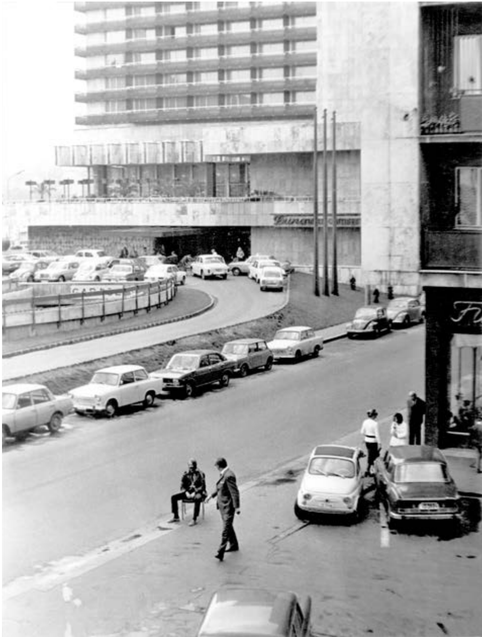
Stjauby Tamás / IPUT, Sit Out – Be Forbidden!, action, 1972.