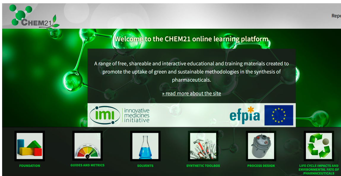
Figure 1. Homepage of the CHEM21 online learning platform. Reproduced with permission from ref 12.

Agenda 21 recognizes that education is vital for achieving sustainable development. 2a In view of a widespread de facto tendency away from sustainability, many universities have signed statements, such as the Talloires Declaration (1990) or the Copernicus Charter (CRE, 1993), 5 in which they pledge to emphasize sustainable development in their training programs, which was partly encouraged by the United Nations Decade of Education for Sustainable Development (ESD, 2005–2014). 6