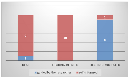
Figure 2. Distribution of Informed Type in the Three Groups

(Question 1: Have you read any news on the event of striving for the official recognition of HKSL?)