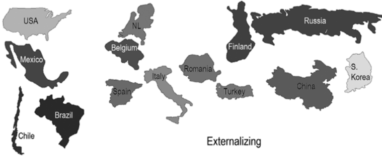
FIGURE 4.3 Map of Externalizing marginal means. Darker shading indicates higher scores