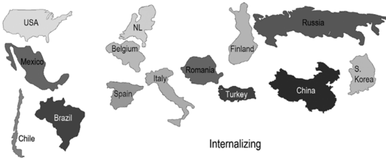
FIGURE 4.2 Map of Internalizing marginal means. Darker shading indicates higher scores