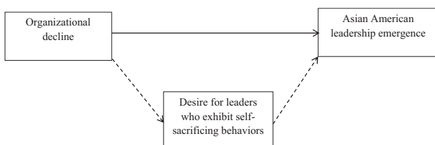
Figure 1. Theoretical model.

Sample. We sampled CEOs from publicly traded companies. Because the data are publicly accessible, this study did not involve an institutional review board review. We obtained data on CEO hiring and tenure from Execucomp and company performance from Compustat North America, which we used to reflect our focus on Asian American CEOs. Our initial sampling frame included every organization and CEO available in both data sets. We removed all data points in which 6-month Treasury Bill returns were not available, because this information was necessary to assess whether firms experienced decline (we describe our opera-