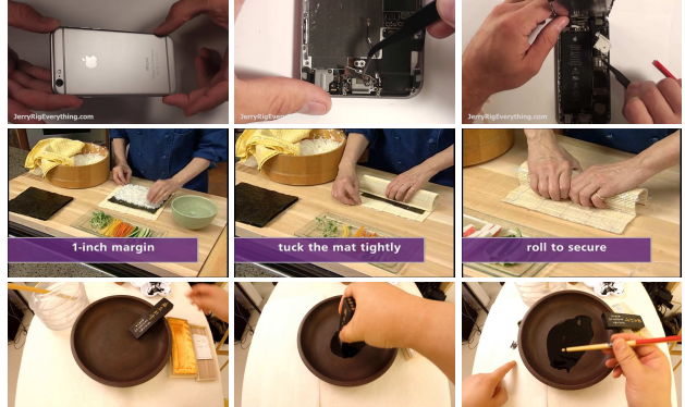
Figure 1. Examples of instructional videos found on YouTube. Top: replacing a phone battery. Center: preparing Maki sushi rolls. Bottom: grinding Chinese calligraphy ink. Each instructional video is a chain of primitive motion types; identifying these can aid the visual understanding of such videos.

Focusing on the visual representation, we note that in comparison to other computer vision tasks ( e.g. image classification, action recognition and video segmentation), the context of the scene is often irrelevant for understanding the instructions. We believe that in order to understand instructional video, successful approaches need to emphasize on fine-grained motion patterns, object interaction and procedural knowledge parsing. Here, we focus on modeling the motion by deriving primitive motion types from the 3D flow field and then measuring the time-varying observed flow in the image plane.