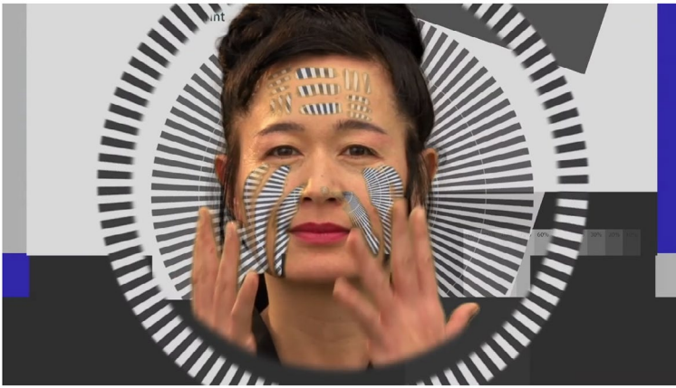
Figure 2. Still from Hito Steyerl, How Not to Be Seen: A Fucking Didactic Educational.MOV File , single-screen video, 2013.