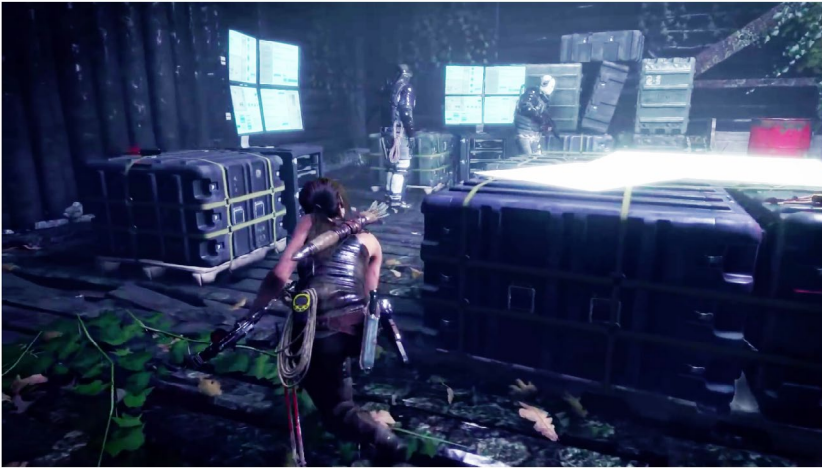
Figure 3. Still from Rise of the Tomb Raider (Square Enix, 2015). Lara Croft sneaks past enemies after luring them away by throwing an object.

Note: See this demo walkthrough of Rise of the Tomb Raider for an example of stealthy gameplay: https://vimeo.com/206408679