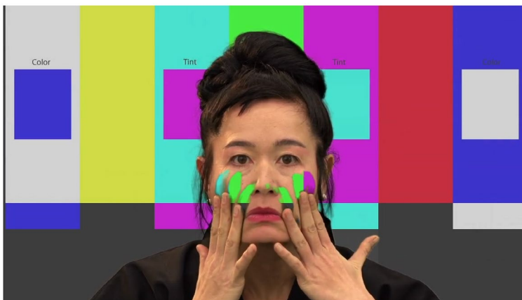
Figure 1. Still from Hito Steyerl, How Not to Be Seen: A Fucking Didactic Educational.MOV File , single-screen video, 2013.

This activation of the body complicates discourses of datafication in fields such as surveillance studies. These discourses tend to foreground how we are tracked and stored as data doubles, immaterial copies of ourselves produced and exploited by public and private interests. Consider as an example the collaboration between surveillance scholar David Lyon and sociologist Zygmunt Bauman, in which they theorize what they call liquid surveillance (Zygmunt Bauman and David Lyon 2013). The authors suggest that, in its current and post-panoptic state, surveillance is highly dynamic. It is no longer centralized and asymmetrical as in the disciplinary society, where it served the purposes of segmenting space and