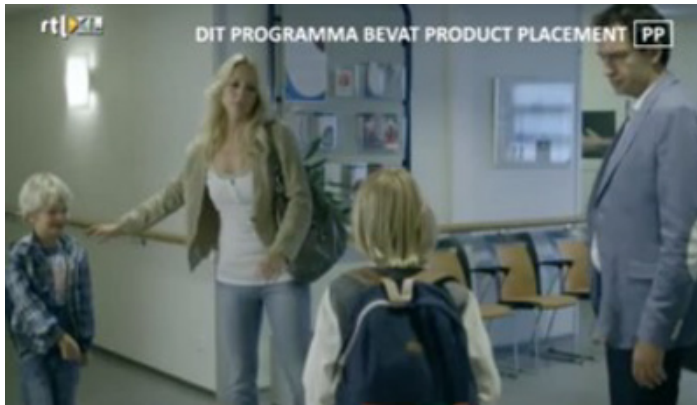
Figure 2: Stimulus material: Disclosure.

Second, the episode was manipulated by replacing the brand placement with a familiar (Doritos), or an unfamiliar brand (Mexi-Snax) using Adobe Premiere Pro (see Figure 3). The brands were subtly placed in two different scenes during the episode in the background, for 30 seconds in total.