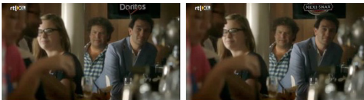
Figure 3: Stimulus material: Familiar vs. unfamiliar brand placement.