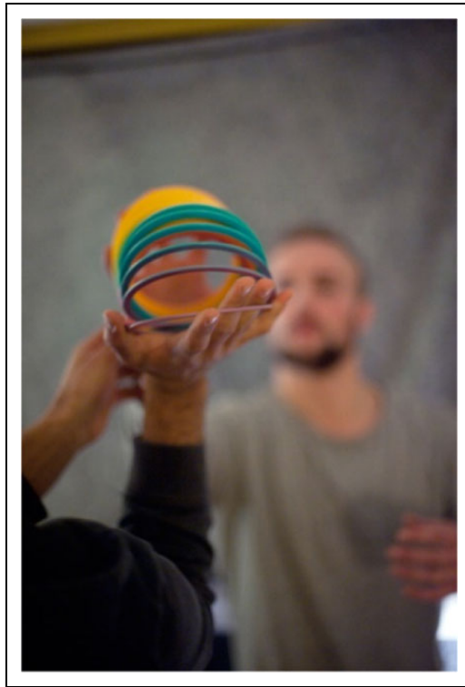
Figure 4. Example of a flow toy—a “spiral”—bounced back and forth between after-party participants (Utrecht, December 6, 2013).

potent I go to a friend who has a professional laboratory scale, you need to turn off the music because the bass will fuck up the measurement. I want to be very careful with that. (Interviewed by M.B., March 2015)