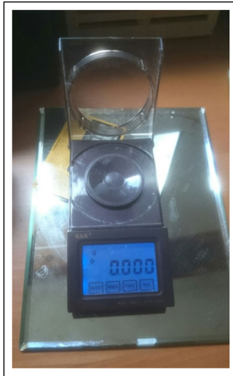
Figure 3. Milligram scale to measure designer drugs.

thinking of taking her next dose, she can check her friend’s phone to know when her last dose was—an example of how phones can have agency within the drug event.