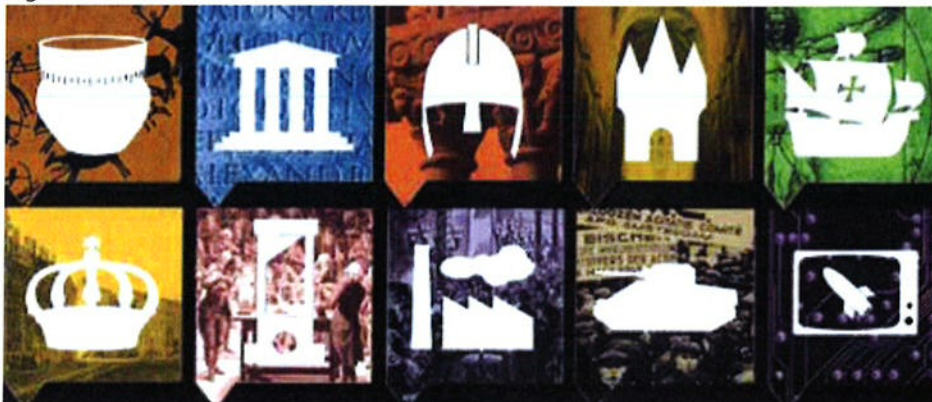
Figure 1: The ten eras.

Note: The abbreviations AD and BC can be substituted by CE and BCE (Common Era and Before Common Era).