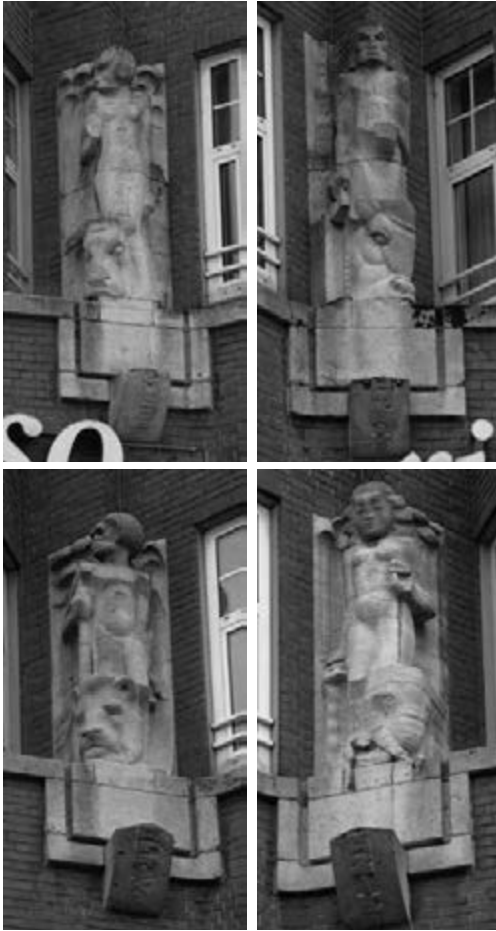
Figure 4 – Theo Vos, sculptures of the continents on the Hotel NH Carlton, Vijzelstraat Amsterdam, c. 1928.

nation and Europe, and all support each other. A less well-known example is the Hotel NH Carlton Amsterdam (Figure 4), also on the Vijzelstraat, originally constructed to help with the shortage of hotel accommodation for the Amsterdam Olympic Games of 1928. It is festooned with all sorts of stylised and exotic images of all parts of the world: to welcome all the competing nations at the games, we