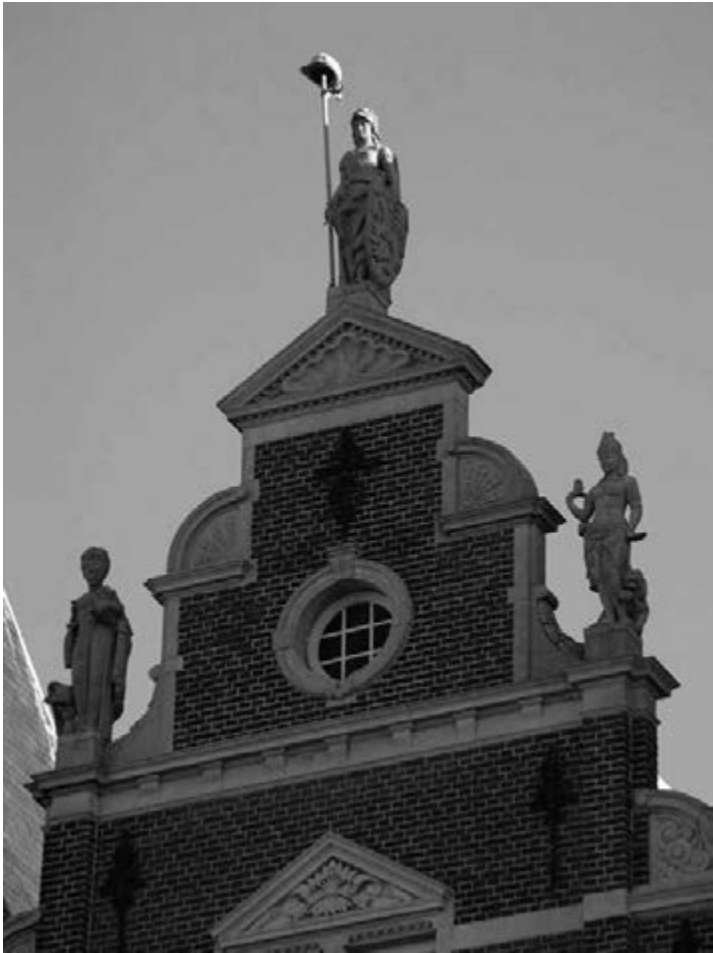
Figure 3 – Willem M. Retera, statues over the entrance to the Royal Tropical Institute, Amsterdam, c. 1920.

also elsewhere in the Netherlands (and indeed further afield). Besides the Shipping House by J. van der Mey, and the Stock Exchange by H.P. Berlage, one could also point to the massive bulk of 'De Bazel' on the Vijzelstraat, built in 1924 by K.P.C. de Bazel as the headquarters of a colonial bank ( De Nederlandsche Handelmaatschappij ). All these edifices celebrate the city, the