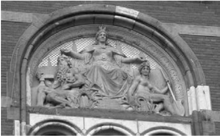
Figure 2 – Ludwig Jünger, Amsterdam and the continents, central and left tympani, Central Station façade, Amsterdam, 1880s.