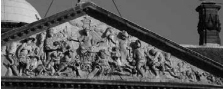
Figure 1 – Artus Quellinus, Amsterdam and the continents, c. 1648, frieze in the west (rear) tympanum of the Royal Palace, the Dam, Amsterdam.

Bull, a horn of plenty and bunches of grapes to show her natural riches and sophistication, and books to show her learning and wisdom. Africa, further to the left, is represented by a naked (and therefore primitive) woman; she has an exotic lion and elephant with her, and is bringing ivory and bales of goods as tribute. To the right of Amsterdam, we see Asia, accompanied by a camel and wearing a turban; she has (as always) a censer and some Turkish tulips, reminding us of the tulip fever of 1636-37. On the extreme right is America, with a feather headdress and a crocodile, tobacco, sugar and silver-mining. Amsterdam is of course the star of this show, but she is the capital of the Dutch Republic, a great trading nation with a worldwide network, and she is herself part of Europe, the best and most powerful queen of the continents. This is a piece of Eurocentric, Dutch, Amsterdam promotion, and it is an image found all over the Netherlands in the 17th century in architecture, books, paintings, sculpture, and many other forms of applied art. Identifying with Amsterdam, the Netherlands and Europe goes perfectly together, and indeed the three levels strengthen each other.