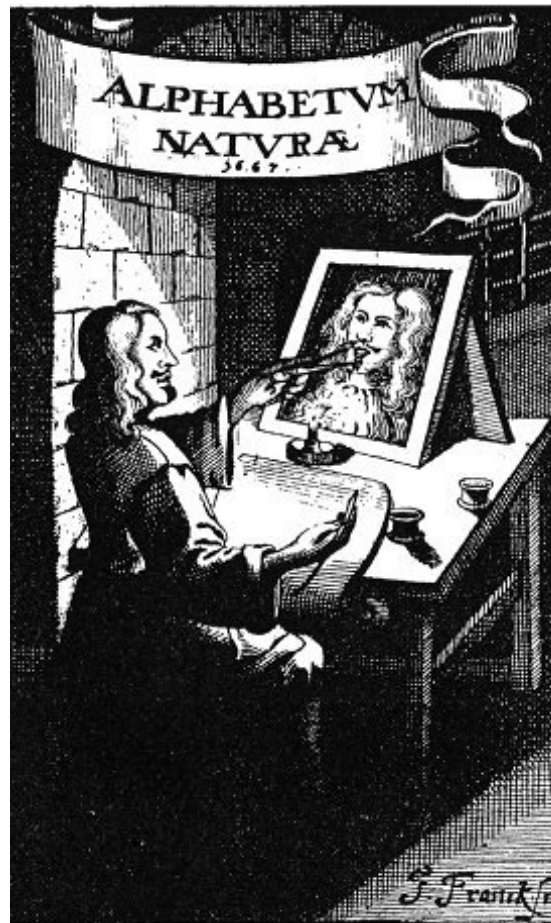
Figure 2, Frontispiece to Van Helmonts Alphabeta vere Naturalis Hebraici (1667)