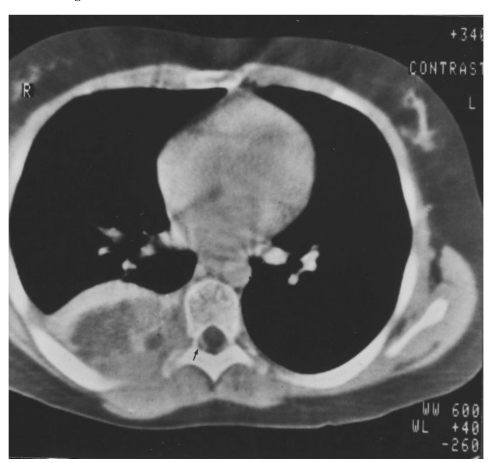
Fig. 2. CT scan of original tumour: Ewing sarcoma of right 7th rib with large soft tissue mass in the posterior thorax and early protrusion into the spinal canal (arrow).

had to be accepted; otherwise, the dose to the cord would have been too high.