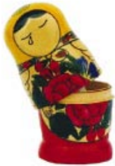
Logo of the Miscarriage Association ( www.miscarriageassociation.org.uk ), an organisation offering support and information for women who have had a miscarriage

other reports summarised in this paper. The fairly large uterine size (mean 13 weeks) and considerable proportion of women requiring blood transfusions before randomisation probably explain the high failure rate of medical treatment in this study.