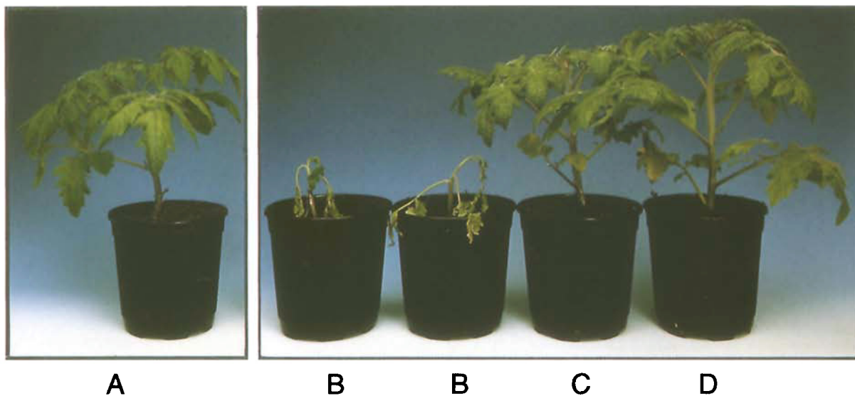
Fig. 3. Resistance in transgenic tomato (cv. 'Moneymaker') plants expressing the four-gene chitinase/ \beta -1,3-glucanase construct, 40 days after inoculation with Fusarium oxysporum f.sp. lycopersici (race 1). Wild-type 'Moneymaker' non-inoculated (A), wild-type 'Moneymaker', inoculated (B) and inoculated transgenic 'Moneymaker' lines MM-539-18 (C) and MM-539-61 (D).