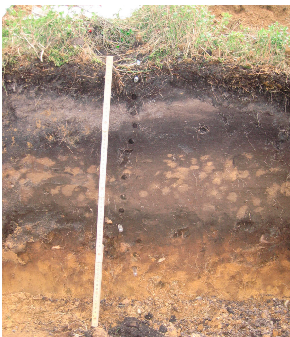
Figure 1 Profile through a bank in the Celtic field of Øster Lem Hede. The small holes were made by taking samples for pollen analysis by the first author.

The banks of the continental Celtic fields were built mostly of local material, coming from the depressions in between, sometimes supplemented with material from farther away (Arnoldussen and Scheele 2014; Gebhardt 1976). Manuring took place in the form of household debris and animal manure. Most of the household debris occurred in the banks, much less in the depressions in between (Arnoldussen and Scheele 2014). The phosphate content of the banks is