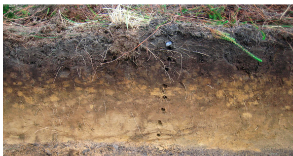
Figure 2 Profile in a depression between banks in the Celtic field of Øster Lem Hede. (Photo W. Groenman-van Waateringe).

The continental Celtic fields are assumed on, a.o., stratigraphical evidence to occur during the Late Bronze/Early Iron Age (transition dated in the Netherlands around 800 BC, Louwe Kooijmans et al. 2005) and to have been in use into the Roman period (Harsema 2005). However, exact dating of the banks will always remain a problem, while the material used for building the banks can be from anywhere and from any depth. Moreover, there is evidence that the banks (not necessarily all of them) may have been used in the Early Medieval period for rye cultivation (Groenman-van Waateringe 2012). If this was the case the Iron Age pollen content of the banks is now overshadowed by younger pollen. So far there are just a few ^{14}\text{C} dates available (charcoal from household debris). These datings, however, are arbitrary because of the original, unknown, provenance of the charcoal (Brongers 1976; Lang 1994; Nielsen and Dalsgaard in press ; Spek et al. 2003). From the Celtic field of Vaassen (Brongers 1976) there are no samples from the banks, just one terminus post quem