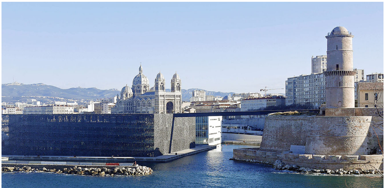
Figure 1. View of MuCEM, including the new building by Rudy Ricciotti on the former J4 pier and the seventeenth-century Fort Saint-Jean. [This figure appears in color in the online issue.]

The complex topography of MuCEM suggests a kind of Mediterranean insularity (see Figure 1). The