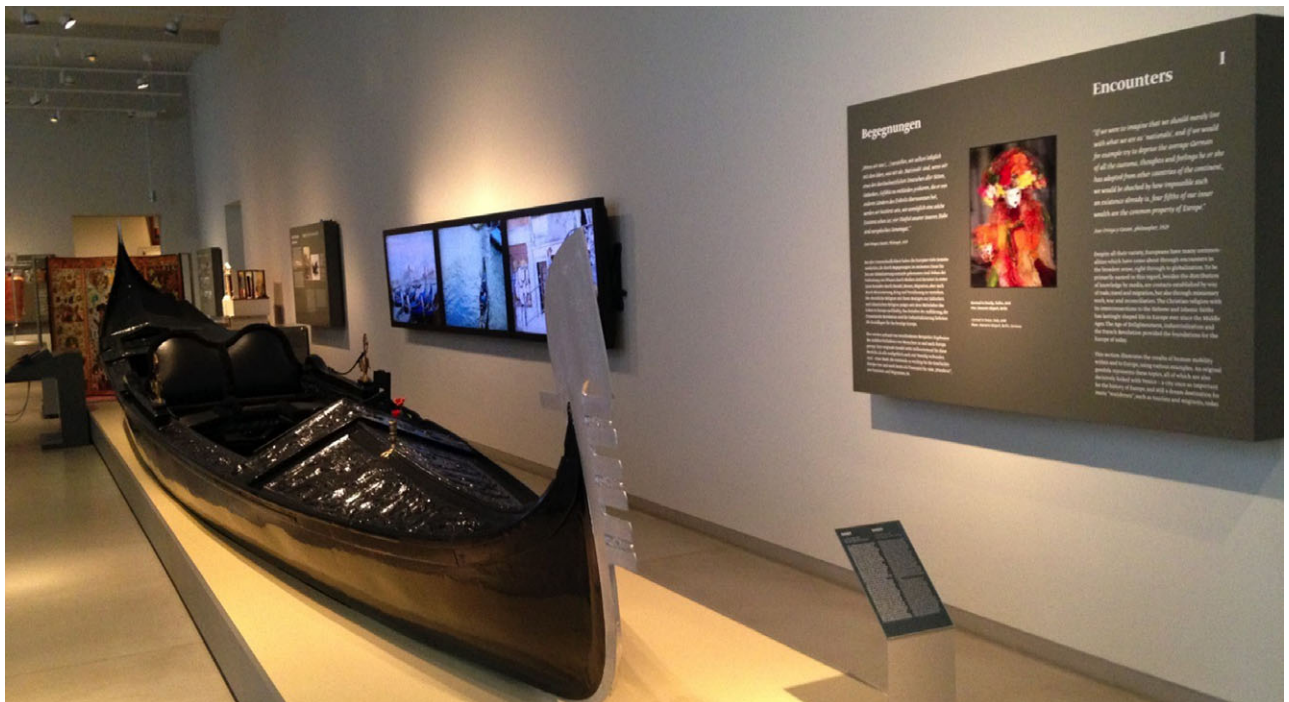
Figure 4. Gondola on display in the MEK. [This figure appears in color in the online issue.]

MEK's permanent exhibit has a Venetian gondola, positioned at the entrance, as its guiding object (see Figure 4); this artifact is meant to symbolize the key exhibition themes—travel,