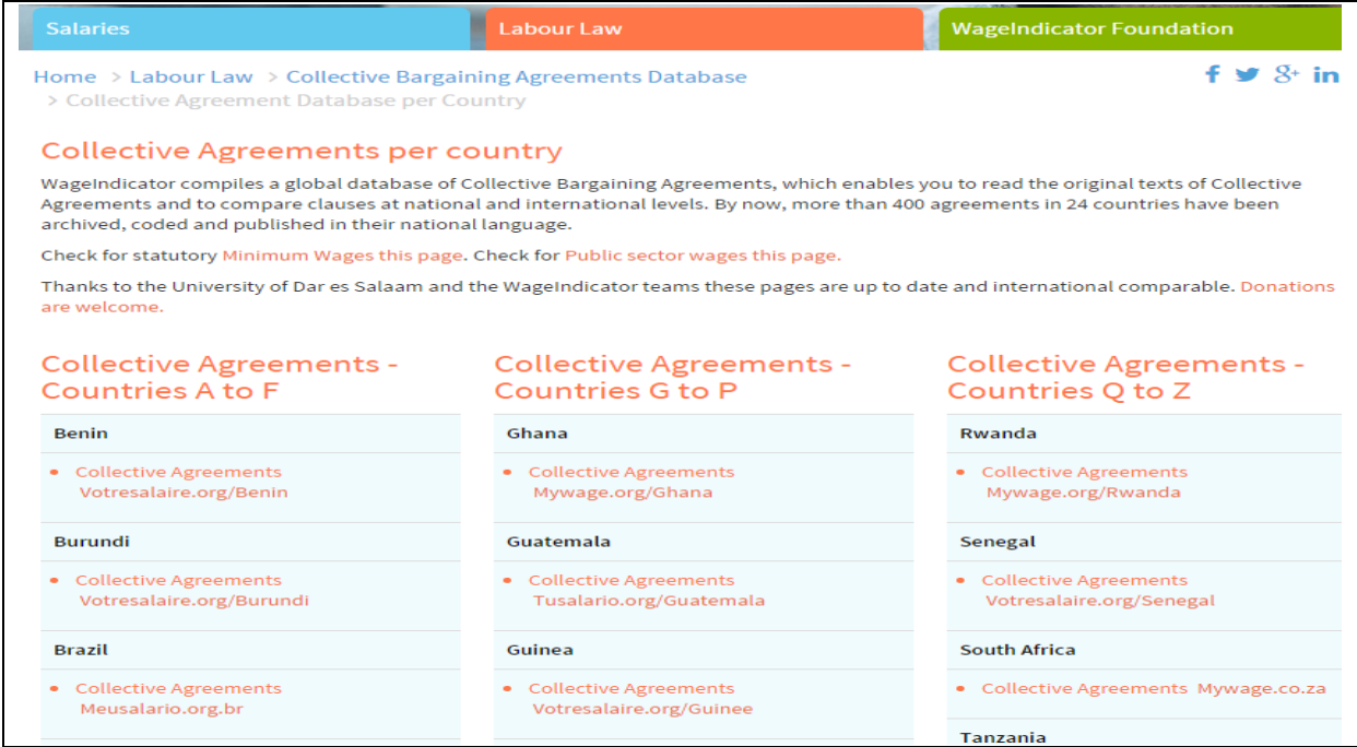
Figure 3 Page after clicking the button Global Collective Agreement Database per Country (screenshot of partial web page)